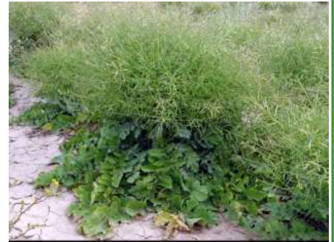
Sahara Mustard.

habitat: proper rainfall and temperatures along with deep sandy soils. The bonus for this species is that it has no competition!! Then to add insult to injury they are a fire hazard. Upon the production of their copious seed they quickly dry. This mustard is extremely flammable and burns rapidly and very hot. Fire has never been a problem in this valley but that has now changed. Because of the intense heat from a fire the seeds of endemics near the surface will be destroyed.