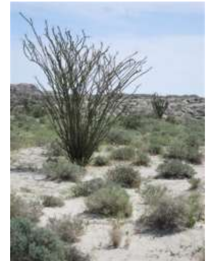
Ocotillo in the Desert