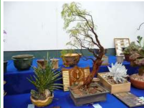
Trophy Table, 2009 Show

It's hard to believe that the summer show is just a little over a month away. Last year's show was very successful, with over 800 show plants and great help from volunteers to make it happen. This year will be no different. To make this