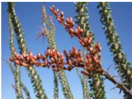
Fouquieria splendens (Ocotillo)

http://www.desertmuseum.org/invaders/invaders_saharamustard.htm