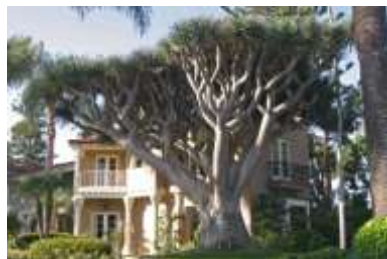
Dragon tree in Muirlands, La Jolla

But to see the largest dragon-tree in San Diego one has to travel to the Muirlands area of La Jolla. There, on private property but quite visible from the street, stands a truly impressive specimen. It is over thirty feet tall and sixty feet across, with a buttressed trunk with a girth (circumference) at base of about twenty feet. It was planted almost a hundred years ago.