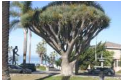
At the Church of St. Phillip

This specimen, at the Hotel del Coronado, offers possibly greater bulk if assessed by the number of stems. It achieved fame after its appearance in ‘Some Like It Hot’ with Marilyn Monroe, Tony Curtis and Jack Lemmon . Massive, well over twenty feet tall and much more across, they say it was planted on the grounds in the twenties.