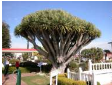
Dragon tree at the Hotel Del Coronado

Balboa Park has a number of fine, tall specimens in excellent condition that are well worth admiring. In the park setting they provide imposing subjects, some well over 20 feet tall.