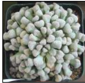
Titanopsis primosii (added by editors)

For one reason or another, many people think mesembs are difficult to grow. Here in Southern California, nothing could be further from the truth. The vast majority of collectable mesembs come from part of Southern Africa where the climate is similar to ours. The key to good growing includes understanding their seasonal growth patterns, providing proper lighting, and a careful hand with watering and feeding.