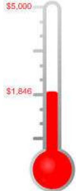
Progress toward the Anza-Borrego Fund Goal

We have started receiving donations for the Anza Borrego fund. For the next two months we are going to do a fundraiser towards the Anza-Borrego fund. SDCSS will match any donation made by a member through the club to Anza-Borrego. Our goal is to donate a total of $5000 between us. The money will go towards purchasing additional holdings for the park. This supports the conservation part of our charter. The cut off for donations is the November meeting.