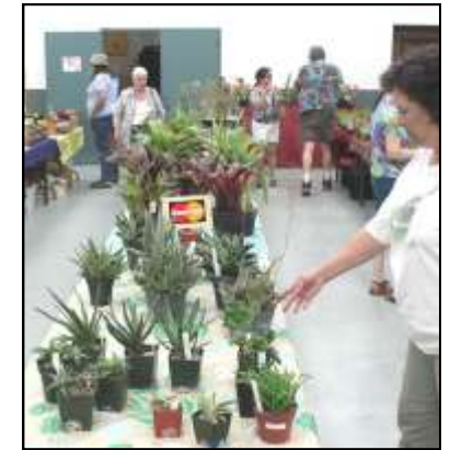
Above Left, Above Right and Below: The Sales Area at the August Meeting