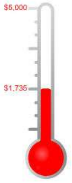
Progress toward the Anza-Borrego Fund Goal

We have started receiving donations (tax deductible) for the Anza Borrego fund. For the next two months we are going to do a fundraiser towards the Anza-Borrego fund. SDCSS will match any donation made by a member through the club to Anza-Borrego. Our goal is to donate a total of $5000 between us. The money will go towards purchasing additional holdings for the park. This supports the conservation part of our