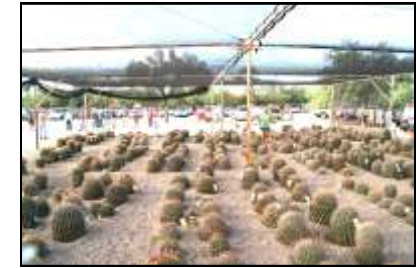
The recent sale of Rescued Cactus by the Tucson Cactus and Succulent Society