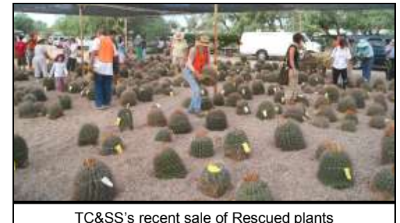
TC&SS's recent sale of Rescued plants

In addition to serving prickly pear punch at its meetings, the TC&SS is known for its Educational Outreach School Grant Program to teachers for the integration of the study of plants into K-12 curriculums. Money for this comes from the society's Cactus Rescue Program that counts having rescued over 50,000 cacti during its existence. If a developer or the county is clearing a site or widening a road, TC&SS provides the labor to rescue barrels, saguaros, hedgehogs or mammillaria that may be otherwise destroyed.