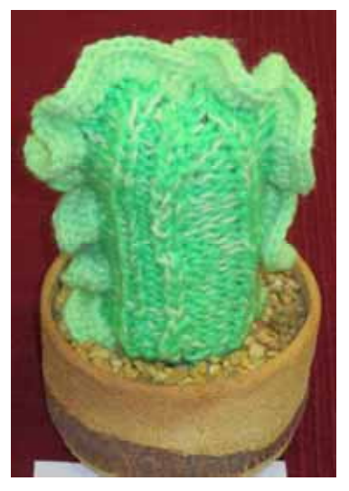
Stenocereus crest var. menzelii seedling Warmest Juergen Menzel