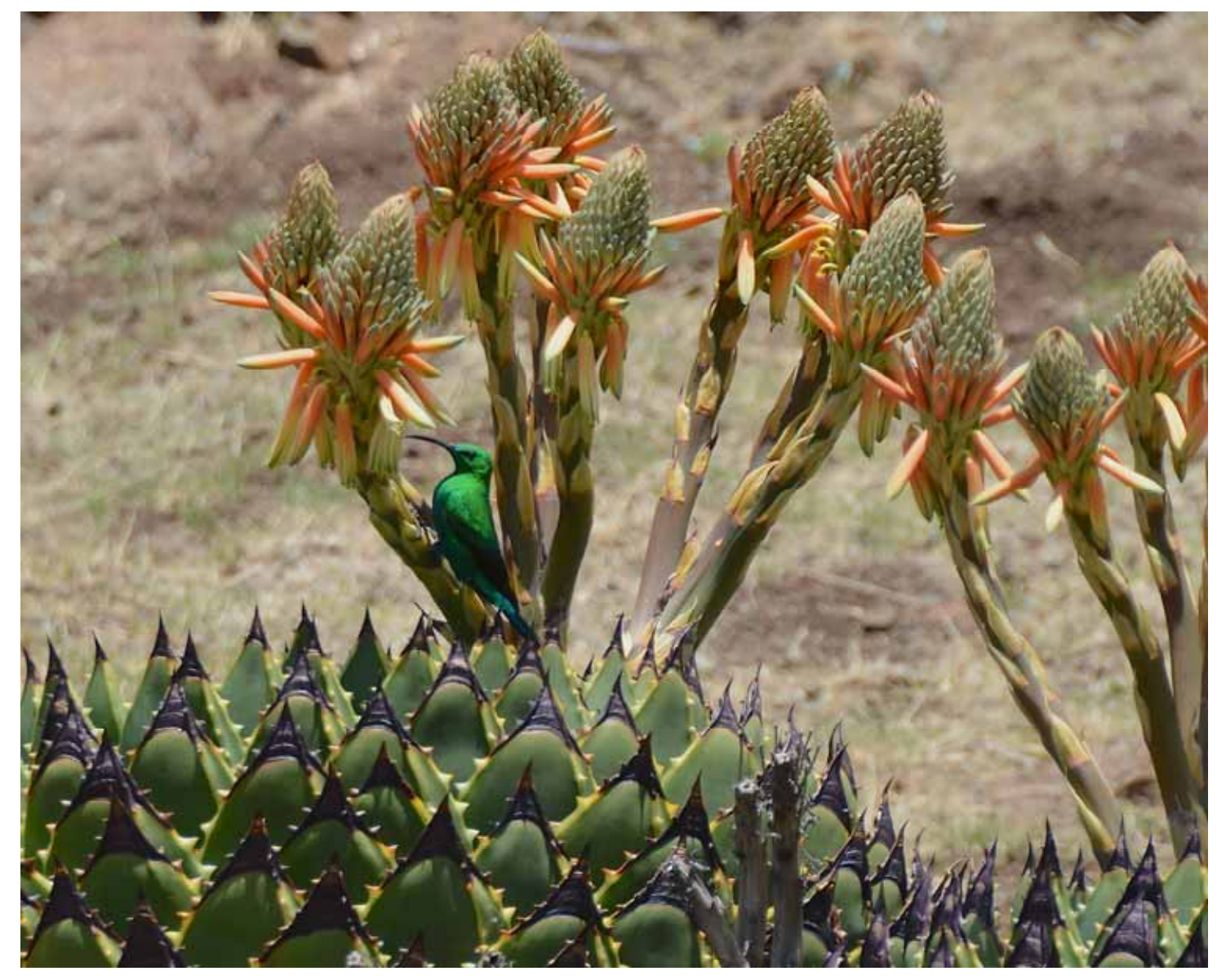
African Sunbird hanging out in flowers of Aloe polyphylla