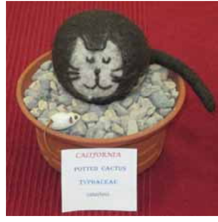
Typhaceae catailinii Most purrfect