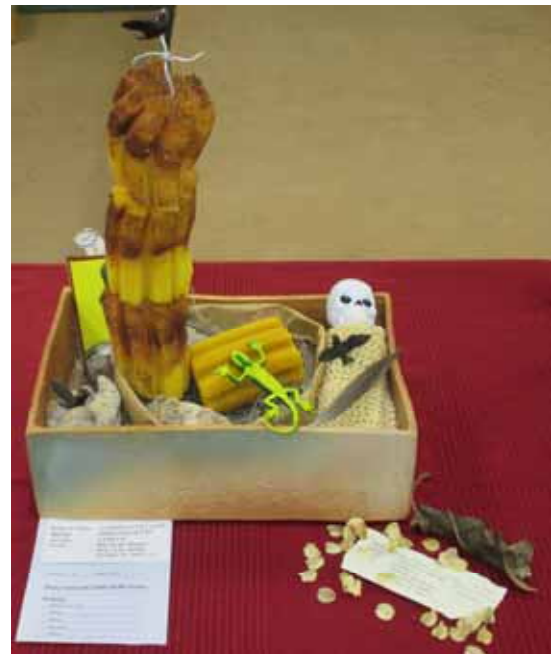
Cardon en El Cajon Toiletto sucio cepillo Most Scary Maria Becker Note: to celebrate Dias de las Muerto (Day of the Dead) Oct 31-Nov 2