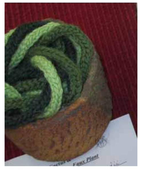
Euphorbia cordii var. woolii Best Use Yarn Jerry Garner Note: Spin me one! Photographer apologizes for lack of balance.

A special thanks to all of you for you wonderful creativity year after year. I am green with envy for all your wonderful talent. Chris