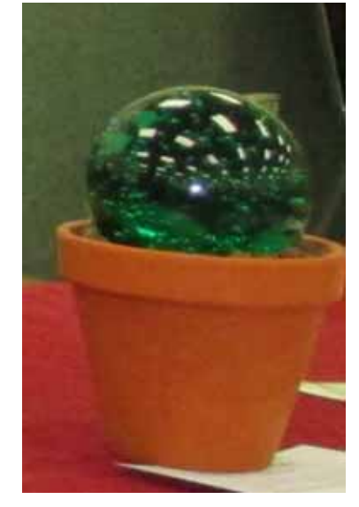
Gymnocalicium crystalballi oides var. "Windows to your soul" Most Esoteric Sara Schell Note: Explore your cactus soul!