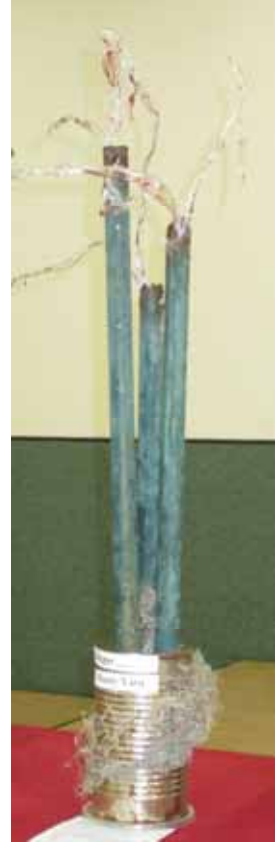
Rusty viro (Rustoadae) Best Use of Recycled Material Antonia Lansorgan Note: Fertilize with Rustolium