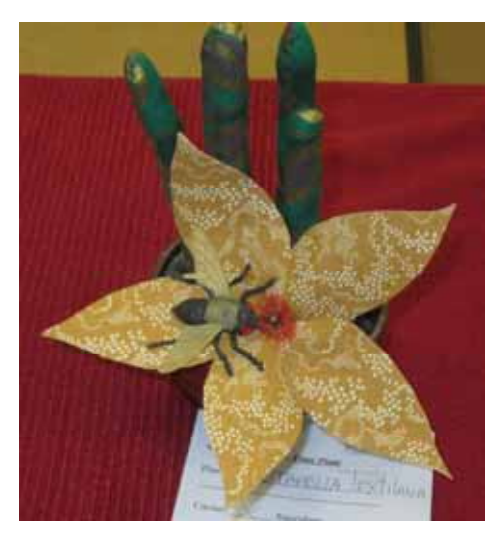
Stapelia textilana Best Fly Food & Most Smelly Donna Couchman