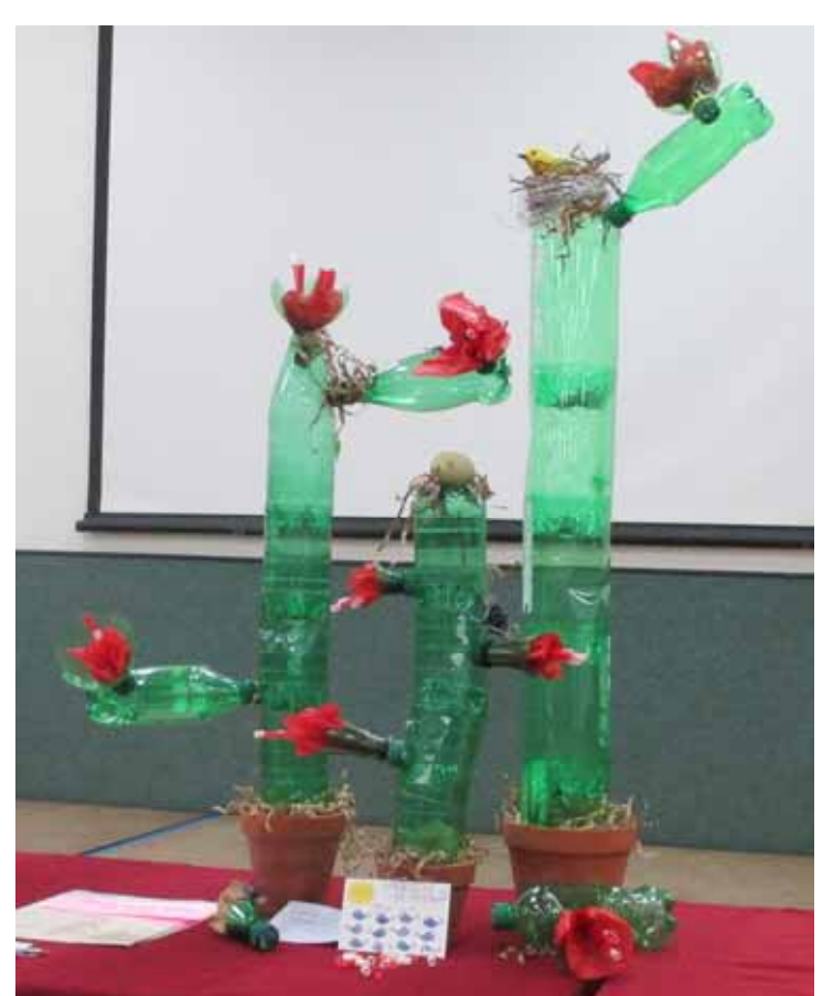
Volume 49 Number 11