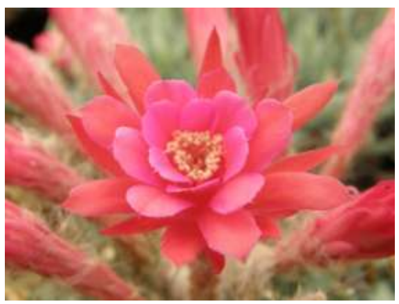
Hybrid Matucana madisonorium sport

There seems to be a hint of Autumn in the air lately, it must be October. I'm remembering last winter and wondering whether some of my plants have been conditioned for a colder than usual winter, or weakened as a result. Some of the winter growing succulents are already off on a good stride. A lot of the Tylecodons are already finishing up their flowering, and a good number of Conophytum never seemed to fall asleep last summer. I've been feeling sort of guilty about