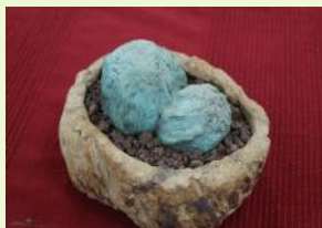
Euphorbia mammilis vibronze patina . Voted "Best Door Stop." Pam Badger: