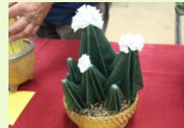
Euphorbia cultivar 'tip and ring.' Voted "Most Electrifying." Don Hunt