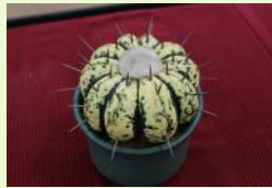
Gourdenbarrel Echinocactus gourdenii . Voted "Most Spinolicious."