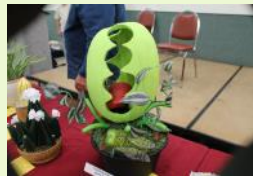
Stapelia audryistwoish carnivorous gigantis monstrous hybrid. Voted "Most Carniverous." No Name