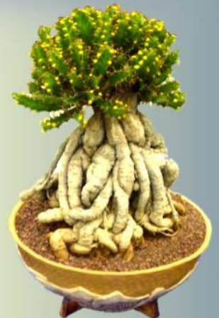
Euphorbia buruana grandicornis by Peter Walkowiak

Small Plants & Specimen Plants Landscape Plants for Arid Gardens Beautiful Handmade Pottery