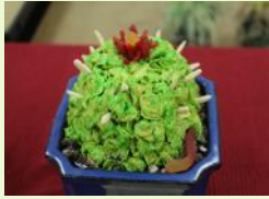
Ferocactus wislizeni 'Candy Barrel' cactus. Totally edible. Voted "Least Nutritious Breakfast." No Name