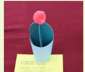
Serious paperaceous . Voted "Most Mid Century Modern" No Name