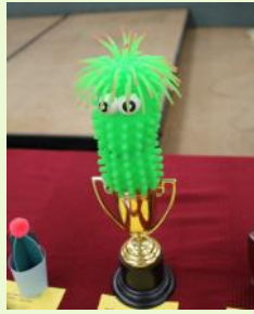
Opuntia subulata . Voted "Most Mediusiouses." No Name