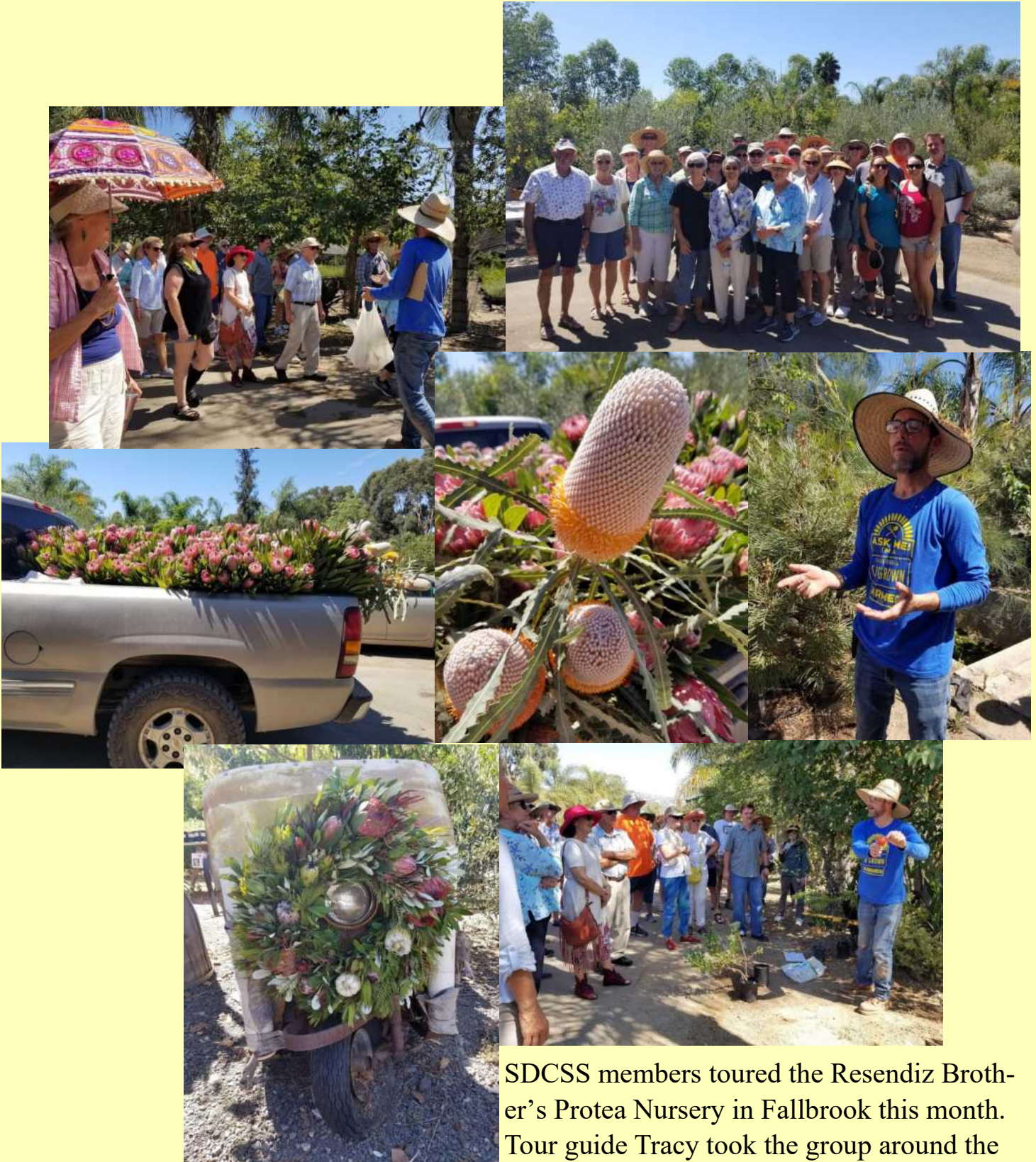
SDCSS members toured the Resendiz Brother's Protea Nursery in Fallbrook this month. Tour guide Tracy took the group around the grounds, explaining the biology of proteas and the history of the nursery.