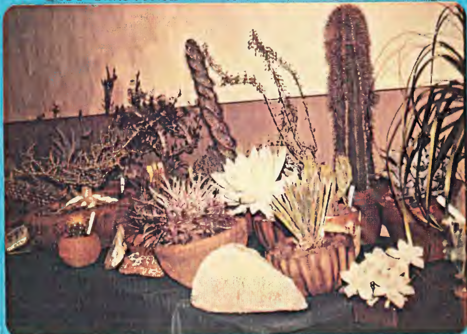
Best Exhibit - Dorothy Dunn