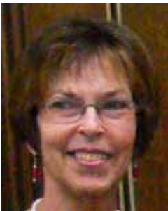
Submitted by Candy Garner