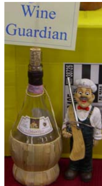
Best Use Of Chianti