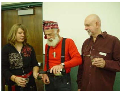
Holiday Festivities 2006