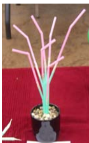
Best Use Of Drinking Straws