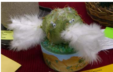
Best Use Of Feathers