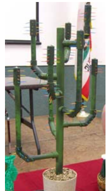
Best Use Of PVC