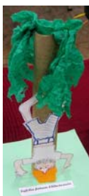
Best Use Of Yoga