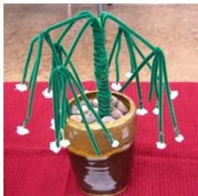
Best Use Of Pipe Cleaners

Best Use of Malachite - Penny Sommerville - Malachitebeadaceae "String of Pearls"