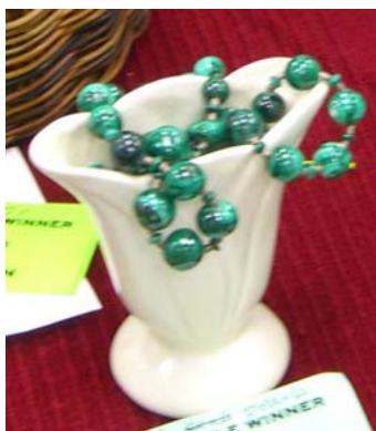
Best Use Of Malachite