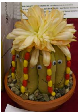
Best Use Of Tic-Tacs