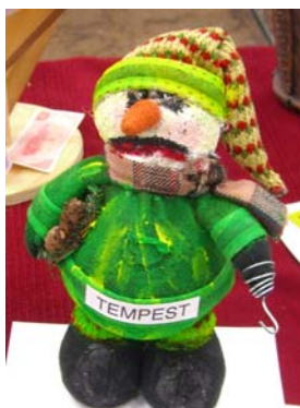
Interesting Use Of Shakespeare