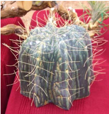
Best Use Of Bass