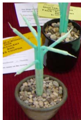
Best Use Of Candles