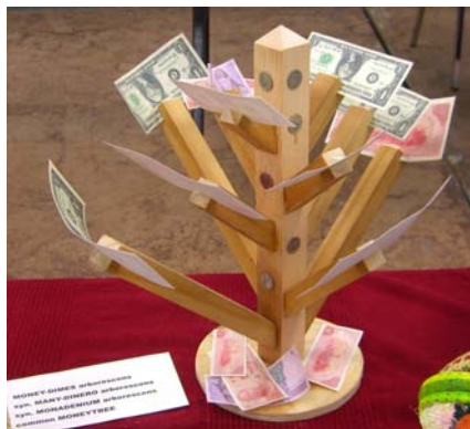
Best Use Of Money