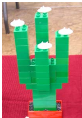
Best Use Of Legos