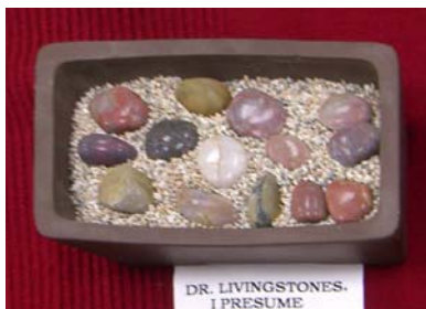
Best Use Of Rocks