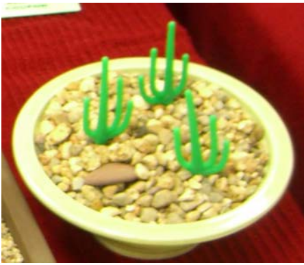
Desert Dish Garden