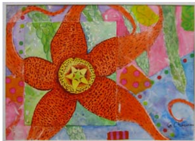
Best Psychedelic Painting

Most Eclectic - No name - Missing ID form