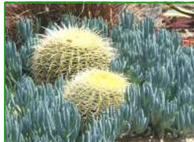
S. talinoides mandraliscae framing Echinocactus grusonii in the editor's yard

There are succulent senecios for a wide variety of tastes and uses. The larger ones, such as S. talinoides ssp. cylindricus , with fine, narrow blue leaves, are good as sprawling shrubs in the landscape. If you prefer upright growth, try S. kleinia , like many of the others a winter grower, which grows in a candelabrum shape and whose yellowish-white flowers in late summer are particularly handsome against a dark background. Then there are the ground-cover types, substitutes for ice plants— S. serpens , with blue leaves and the somewhat similar S. talinoides ssp. mandraliscae (formerly S. mandraliscae ).