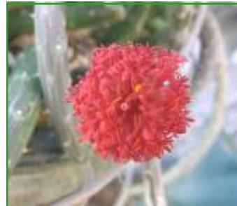
Capitulum of S. pendulus

Senecio is an enormous genus, of which “only” about 80 are counted as succulent—that is, fleshy enough to live successfully in dry regions. They are members of the huge family Asteraceae (also known as Compositae), whose defining characters are their composite flower heads made up of a group of tiny florets that appear to be one single flower—it is called a capitulum—and that may or may not be surrounded by a group of petal-like ray flowers—in short, these are daisies. Composites form the largest of all plant families—Rowley says there are over 21,000 species—but most of them are not considered to be succulent, so we can ignore the sunflowers, the asters, the, well, daisies, and concentrate on those that we succulent collectors favor. Most of the succulent senecios are native to Africa, particularly the Cape region; a few are from Madagascar or Arabia, and one, Senecio kleinia , is native to the Canary Islands. There is one borderline succulent species from Mexico, a small tree called S. praecox , but it is not common in cultivation in this country.