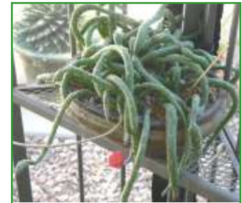
S. pendulus in the editor's garden

that look good in a hanging basket, such as S. radicans and S. pendulus . Some species stay small and cute: S. citriformis , with little leaves shaped like lemons, as the name implies; or the string-of-pearls type, S. rowleyanus (another candidate for a hanging basket). S. articulatus will give you a little too much of a good thing by abjectly falling apart if you bump it, and every piece will become a new plant. One of my favorites is S. crassissimus , which is a shrublet with purplish leaves borne vertically on the stems. Then there is the one with the unpronounceable name, S. oxyriifolius , which looks a lot like a nasturtium until it puts out its little flower.