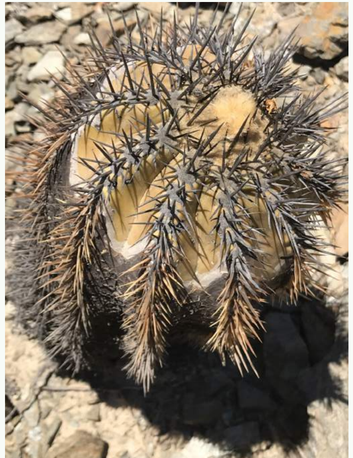
Copiapoa echinoides in habitat, Chile