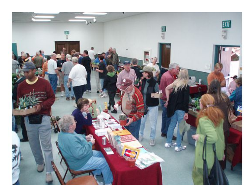
Reception area, 2008 Show & Sale

If you have any questions please contact any member of the board. If you are interested in working with one of these groups or have suggestions please contact the Strategy Owner. We cannot achieve our Vision without the help and support of everyone in the organization.