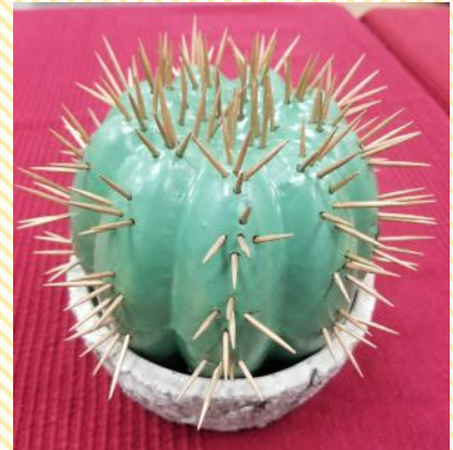
Chuck Ramey Ferocacti pumpkinus "Most Gordalicious"