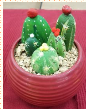
Sherman Blench Opuntia painted deserti “Best Painted Desert”