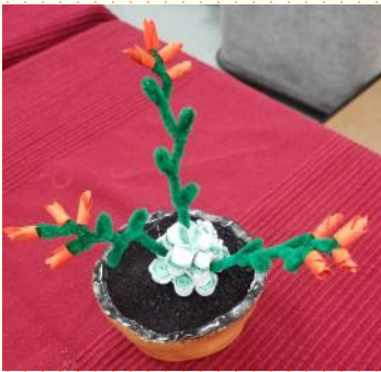
Olga Batalov Echeveria setosa var quilliflora “Most Curley”