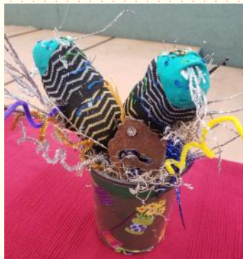
Sue Ann Scheck Schreckloch with Weeds “Most Comfortable”