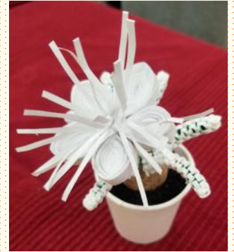
Olga Batalov A-vinyl-onia grandiformis var. quilliflora “Most Artistic”