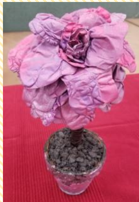
Monica Mosack Echeveria afterglow X "Afterglobbiflora" "Best Use of Old Prom Gown"