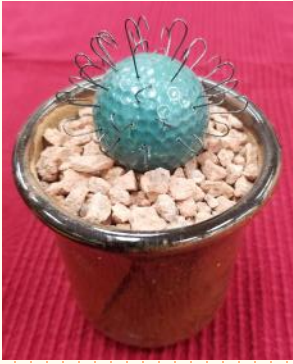
Don Hunt Whathfuxia “Best Use of Nomenclature”