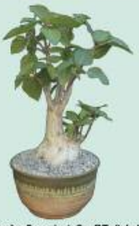
Best Novice Succulent: Geoff Twitchell's Ficus palmeri