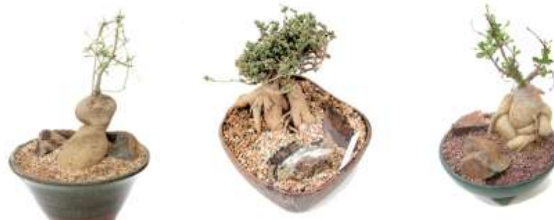
Above: Some of the more interesting auctioned plants. See page 7 for more auction action.

The auction was a great success, bringing in almost $1,000 for the trophy fund. I want to thank everyone involved, donors, volunteers and bidders. Next year the auction will go back to the old format and will benefit the Anza Borrego Foundation.