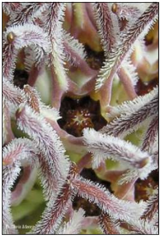
P. cubiformis flower.