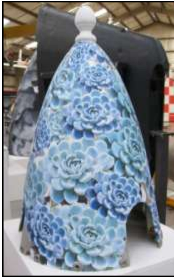
Aeonium covered DC-6 propeller hub on display at the Pima Air and Space Museum, Arizona.