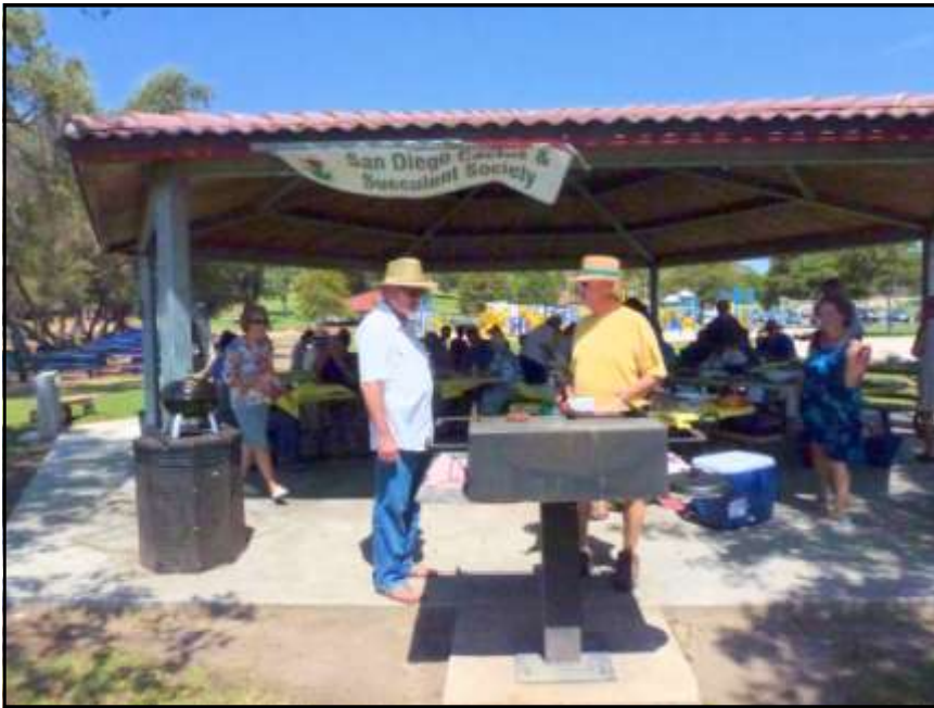
Above: The Grill Guys.