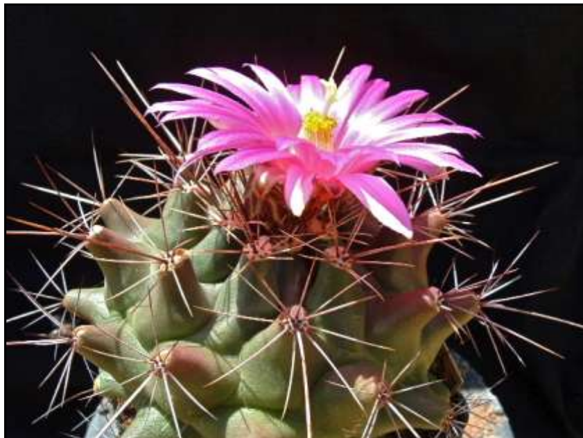
Thelocactus Matidae Thelocactus