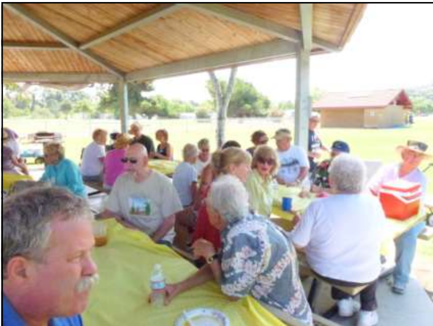
Below: The Gabbers