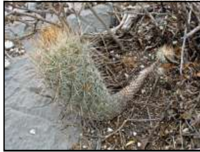
Above: T. hastifer Below: T. conothelos