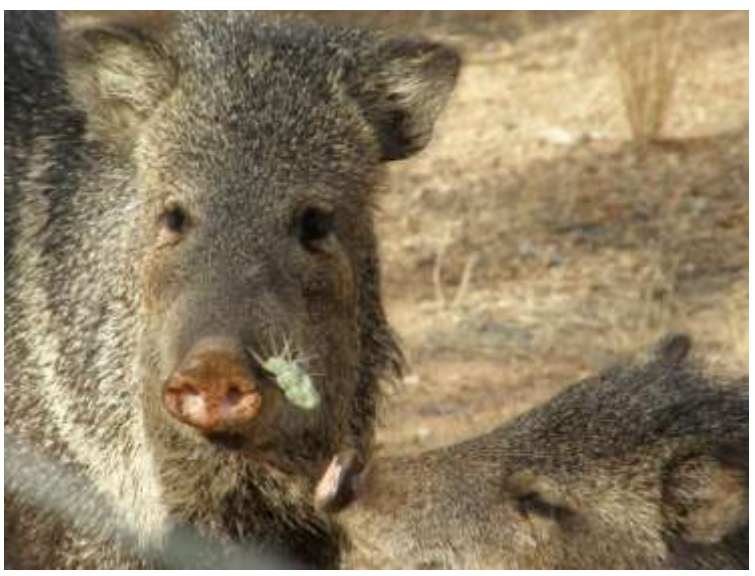
"A true cactophile isn't bothered in the least by prickly pears!" One of the herd that make their home in the vicinity of John Durham and Susan Wunderlich's new homestead, former members of the San Diego Cactus and Succulent Society now residing in Tucson, AZ.

Line the bottom of a 13 by 9 by 2 inch dish with 1 bag of cookies and layer bananas on top. In a bowl, combine the milk and pudding mix and blend well using a handheld electric mixer. In another bowl, combine the cream cheese and condensed milk together and mix until smooth. Fold the whipped topping into the cream cheese mixture. Add the cream cheese mixture to the pudding mixture and stir until well blended. Spread the mixture over the cookies and bananas and cover with the remaining cookies. Refrigerate until ready to serve, preferably overnight. The recipe can be cut in half for a smaller serving size.