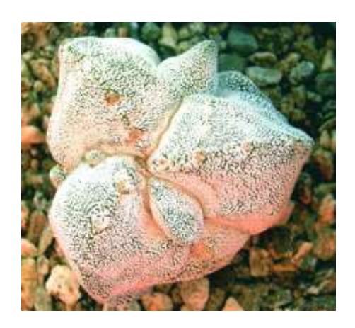
Mark's Astrophytum "Onzuka" variety, grown from seed.

comes the homemade desert and it's every bit as delicious and nutritious as the main course! Thanks to everyone for attending and participating with our fun little group, it was a great day.