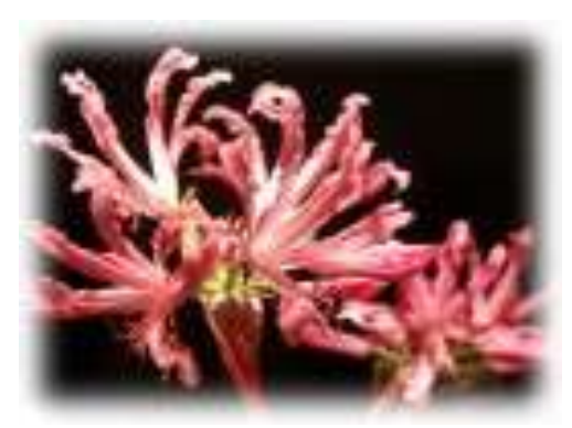
Nerine bowdenii "Pink Triumph"

Flowerbulbs 503 815 Kilchis River Road Tilamook OR 97141 http://sales@flowerbulbs.com