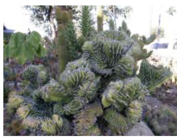
Crested Euphorbia taking over a small mound in my tiny garden

The topic of succulents in the landscape has become almost as much a matter of functionality as one of design, and is likely to become increasingly pragmatic in terms of lower water usage and tolerance to drought. I have now had the pleasure of growing succulent plants in two completely different environments, in a variety of settings, for a good number of years. I'm happy to say I have more questions than answers, and I'm still inspired by the myriad of new succulent forms avail-