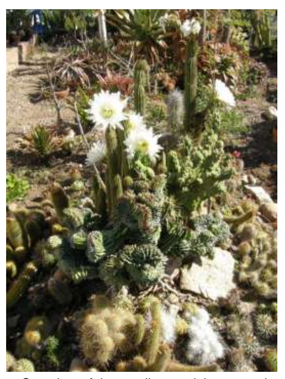
Overview of the small mound the crested Euphorbia is living on

Drought has played an interesting role with regards to the history of succulent planting choices. In southern California specifically, there have been countless entrepreneurs who've sought to create kind of a lawn-substitute that will stay green and be comfortable to humans and pets without guzzling water like an alcoholic after a day of restraint. We have some of the most beautiful margins on our highways, and I'm always curious and interested to see the intermingling different colors of bullet-proof mesembs growing along our roadways. In the residential sense we can see mirrors of this with various and sundry creepers, vines, and clumpettes. Bearing in mind the cost of running irrigation back at the turn of the century, and you can see why Eucalyptus and other Australian non-natives ran shortly after their introduction. In