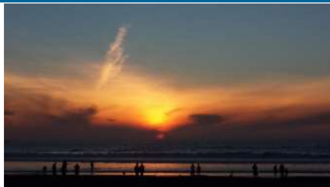
A San Diego Sunset