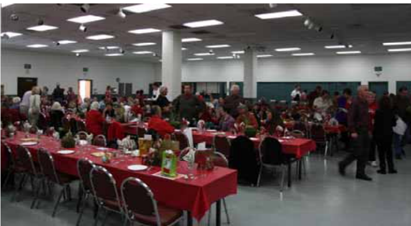
A great Holiday party. Attendance was 122