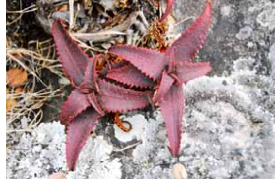
Aloe erythropylla (select)

We all started into this with some sort of naïveté but most can remember the single point when you knew you were hooked. For me, It was when I was thirteen and it was Lithops that did it for me. I know that for many this particular group can be a problem one and most of you can attest to the many plants of this that you have killed. I would delve into the part about how to grow these but that is not my direction here. Ask me later!