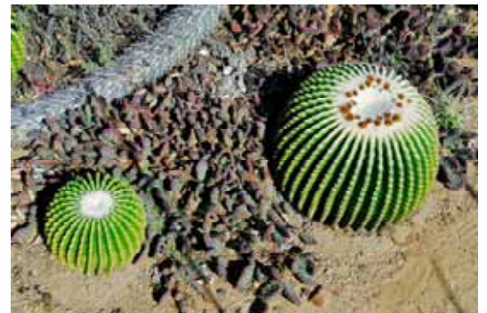
Echinocactus grusonii brevispina

One of my favorite things to do as a collector (and yes I admit to it! I'm a collector) is to grow different forms of the same species i.e., much like some might collect figurines of giraffes; they collect big ones, small ones, wooden ones, glass ones, etc.