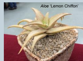
Aloe 'Lemon Chiffon'