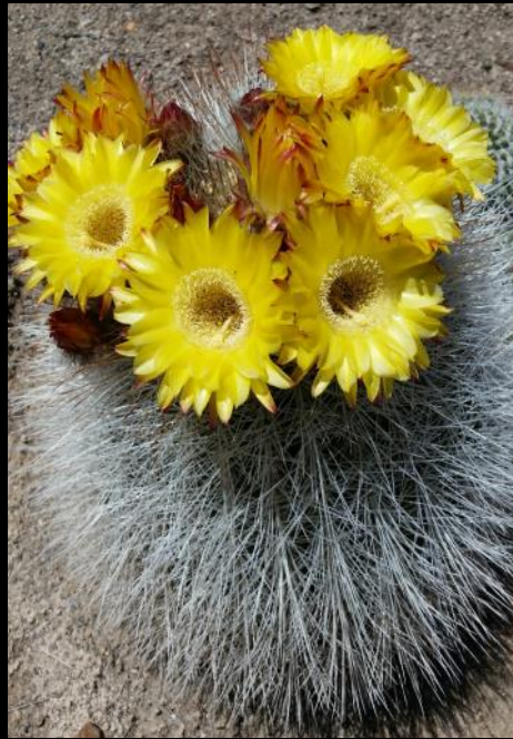
Soehrensia [ Echinopsis ] Formosa .