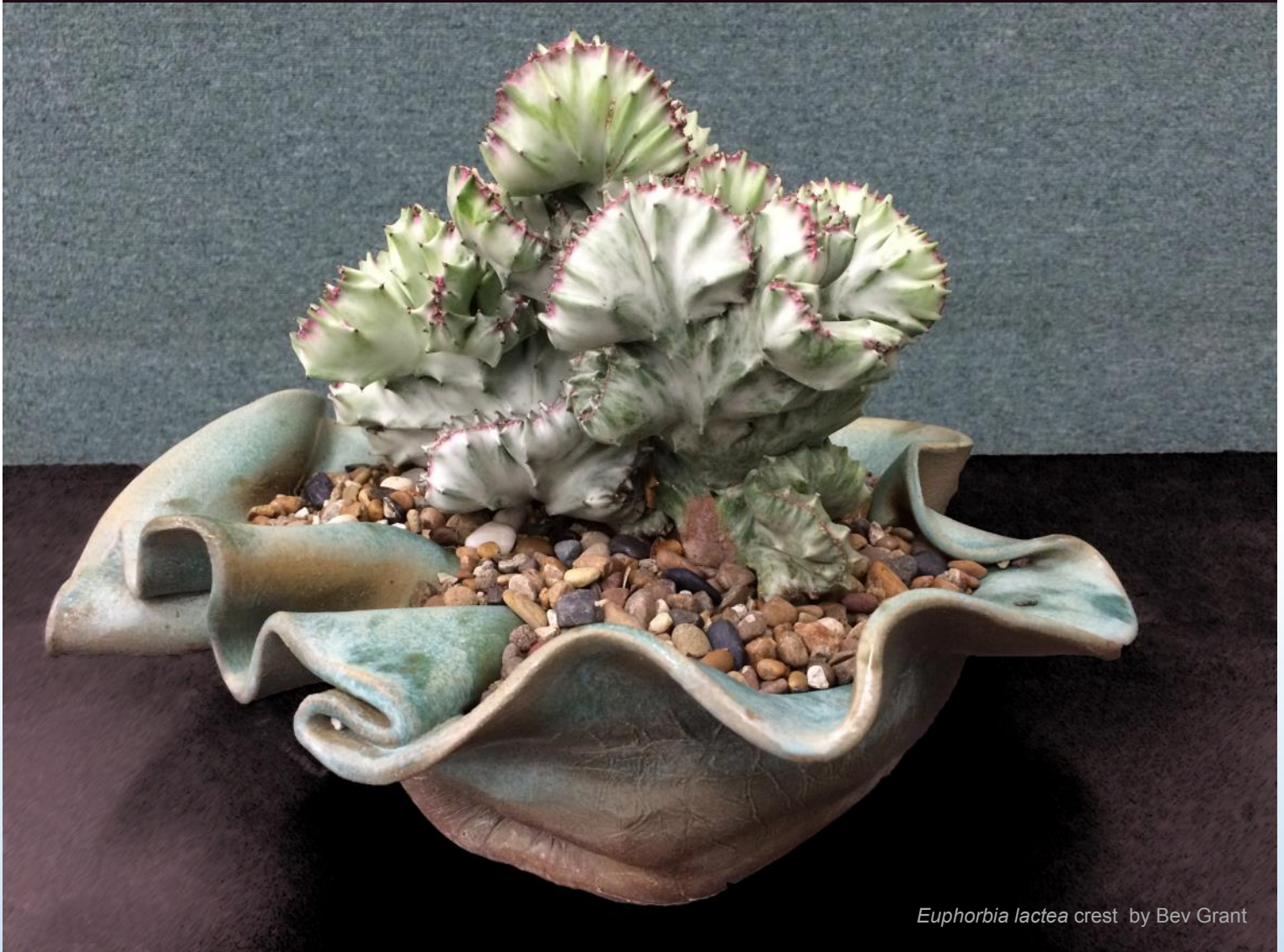
Euphorbia lactea crest

The May General Meeting is a week earlier than usual! Mark your calendar for Saturday, May 7th, 1:00 - 4:00 pm Rm 101, Casa del Prado, Balboa Park Pre-meeting Workshop "Show Preparation" at 11:00 am New Member Orientation, at 12:30 pm See Inside for more Details