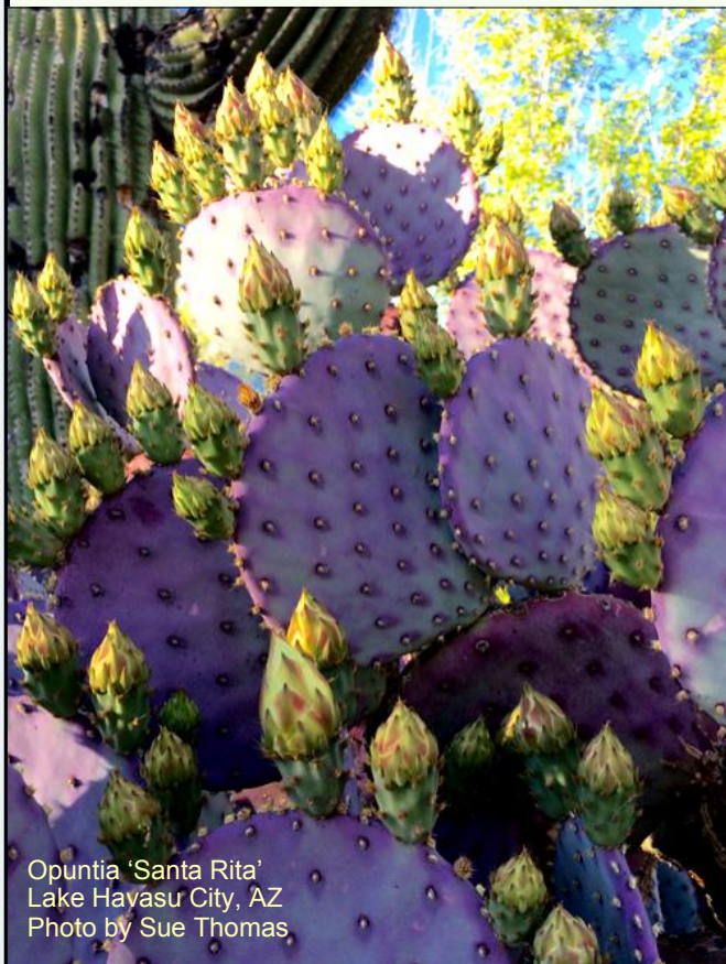
Opuntia 'Santa Rita' Lake Hayasu City, AZ