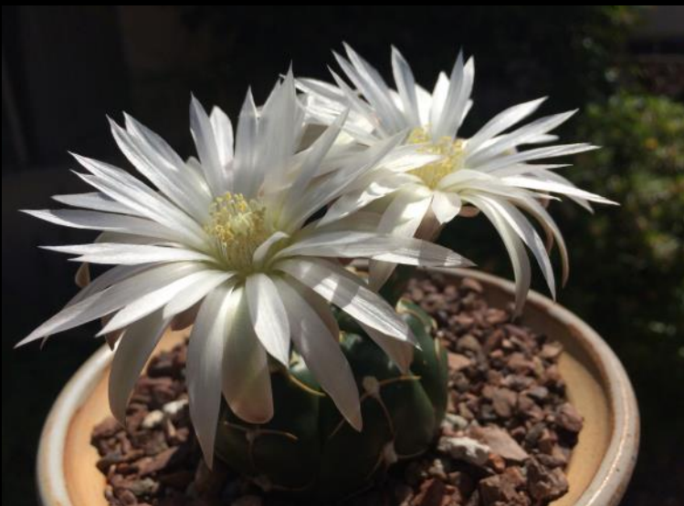
Gymnocalycium denudatum Sue Thomas