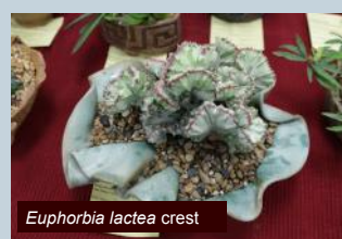
Euphorbia lactea crest