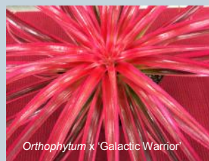
Orthophytum x 'Galactic Warrior'