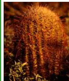
Spiny Barrel Cactus Ferocactus cylindraceus

Rep. Darrell Issa (R-Vista) has now introduced HR 4304, legislation to add to the existing Agua Tibia Wilderness and Beauty Mountain Wilderness on public lands in northern San Diego County. Beauty Mountain is "an ecological transition zone between Anza-Borrego Desert State Park on the east and the endangered coastal sage scrub habitat, the Coast Range, on the west." It is home to scrub oaks right next to cactuses. The following genera are examples of what can be found in the area.