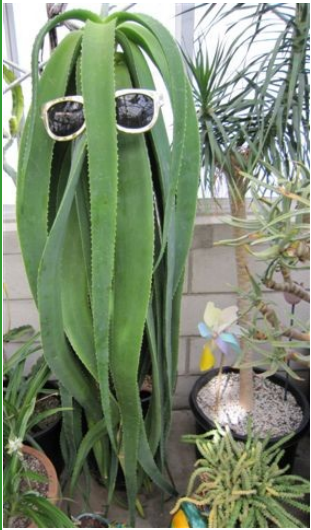
Fun at the Forum