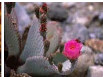
Prickly-pear and Beavertail Cactus Opuntia engelmannii and basilaris