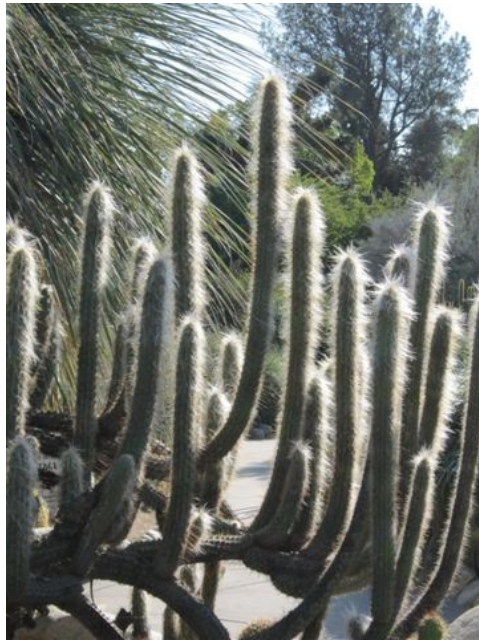
The sun on Cleistocactus strausii at the Huntington Desert Forum