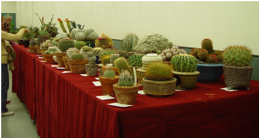
Cactaceae entries at the 2007 Winter Show.

The growth and evolution of our Winter Show over the past five years has been phenomenal. From maybe 50 to 60 plants, it's grown to what we had last year - full tables and over 200 plants. This year is no differ-