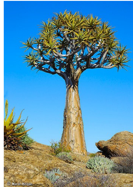
Aloe dichotoma in Namaqualand

The Famed and timeless quiver trees that grow in South Africa and Namibia have begun dying over the past few years, with officials cautioning that they are the latest victims of climate change. The tree, also known as Aloe dichotoma , can live to be more than 300 years