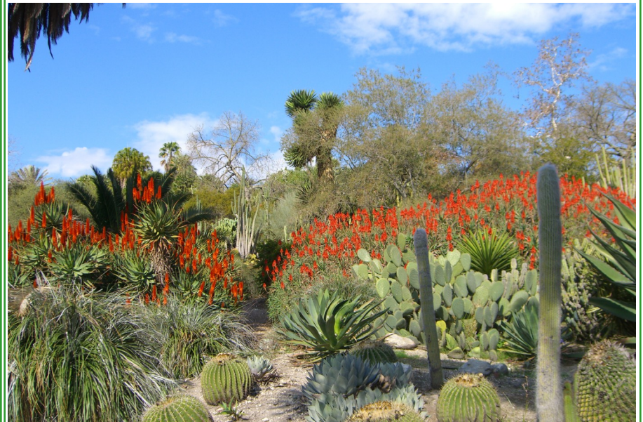
Blooming Aloes (above) and the Chinese Garden (below) as seen at the Huntington Desert Forum

The trip to the Huntington on the 17th was great, as usual. We partnered with the Palomar CSS to fill a bus, which made it to the Huntington at just the right time for me to meet them. Between the two clubs I think we had over 70 people there. We wandered through the Succulent Conservatory , strolled through the Cactus Garden , talked to people from other societies and had a lovely morning. We broke for lunch,