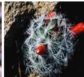
Corkseed Fish-hook Cactus Mammillaria tetrancistra

In addition, this wilderness provides a critical bridge for migrating wildlife. The official title is "Beauty Mountain and Agua Tibia Wilderness Act of 2009." To get the whole story, point your browser to http://wilderness.org/content/pr-wilderness-20091215 . Again, this area serves as a critical plant and wildlife migration corridor between Anza-Borrego Desert State Park on the east and the coastal mountains of Riverside and San Diego counties to the west. All too often such biological pathways are severed by development, especially in southern California.