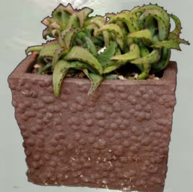
Best Winter Grower-Novice- Antonina Lansangan- Aloe castilloniae