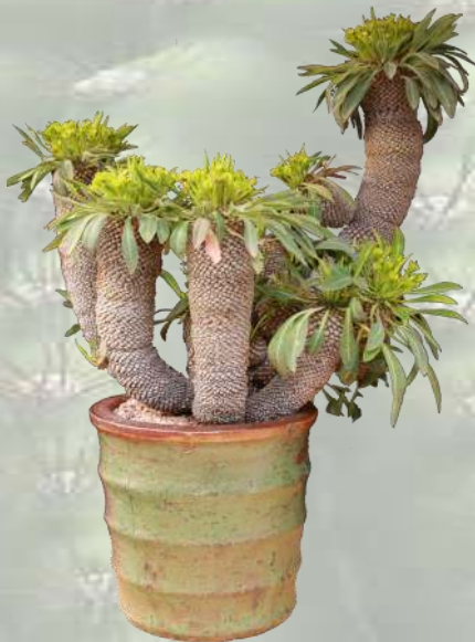
Best In Show - Peter Walkowiak- Euphorbia bupleurifolia