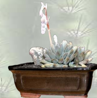
Best Succulent- Novice Shawn Soutiere- Pachyphytum compactum