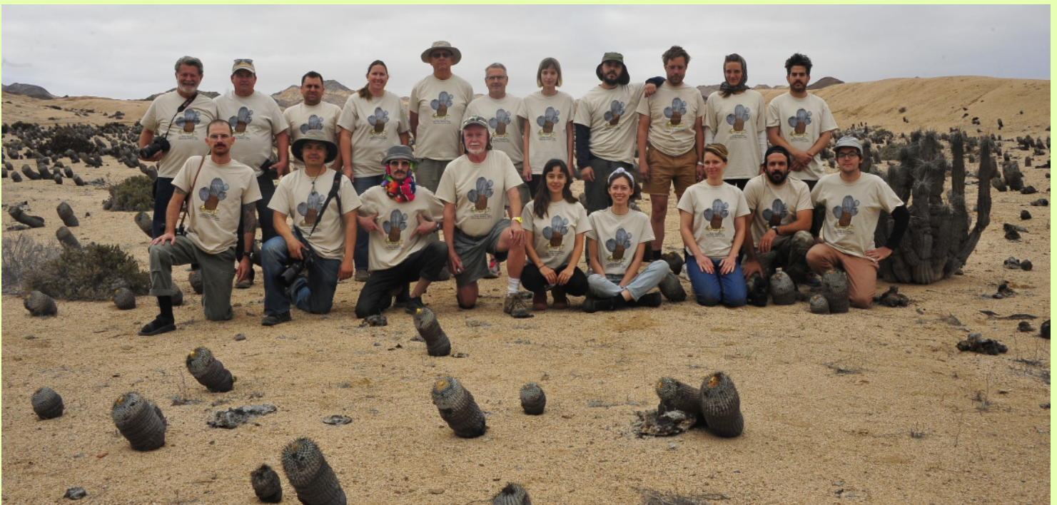
The Atacama Expedition 2018: Our team of 20 with our Copiapoa columna-alba T-shirts in-habitat.

Similar to the coast of Namibia, the coastal and inland regions of northern Chile, known as the Atacama, is mainly watered by amazing fogs, "the Camanchacas." These fog-fed regions, in two of the driest deserts in the world, have some of the most interesting cactus and succulents to be found anywhere. The Atacama of northern Chile has an endemic genus considered by many to be one of the most dramatic to have ever evolved, the Copiapoa . This ancient genus is also believed to be tens of thousands of years old, and there are those who feel it might well be on its way out! The ocean currents that affect the coastal Atacama have changed considerably over the last hundreds of years, and now its only source of moisture is primarily from consistent dense fogs. Some of these areas rarely, if ever, get rain and the plants that have evolved there live almost entirely off the heavy condensation from the Camanchaca.