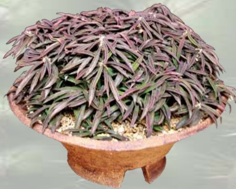
Best Succulent - Advanced- Don Patterson Euphorbia decaryi X cylindrifolia