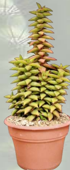
Best Succulent- Open- Matt Maggio - Aloe pearsonii