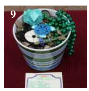
Faux Plant *View on page 6