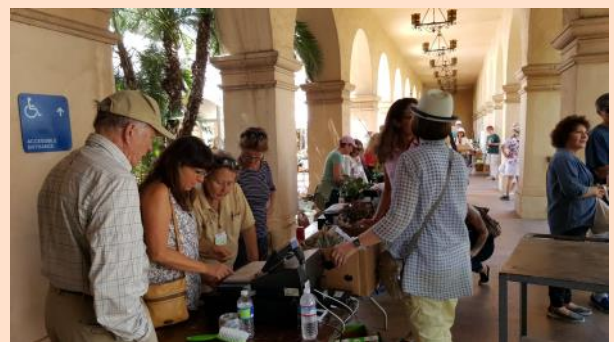
Volunteers at the 2016 Summer Sale