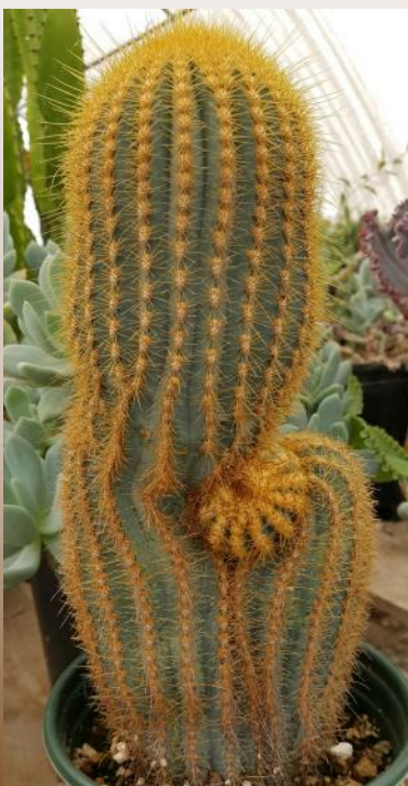
Micranthocereus estevesii

Send your favorite cactus and succulent photos for possible appearance in the next issue of Espinas y Flores. Send to: newsletter@sdcss.net