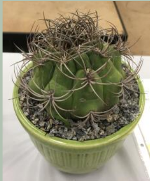
Gymnocalycium pflanzii Don Israel Intermediate Cactus 2nd Place