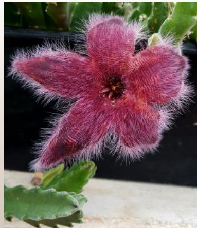
Stapelia hirsute Collette Parr