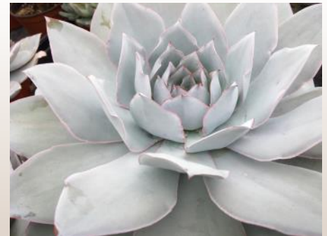
Echeveria cante Tina Zucker