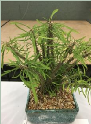
Euphorbia species Don Israel Intermediate succulent 1st Place