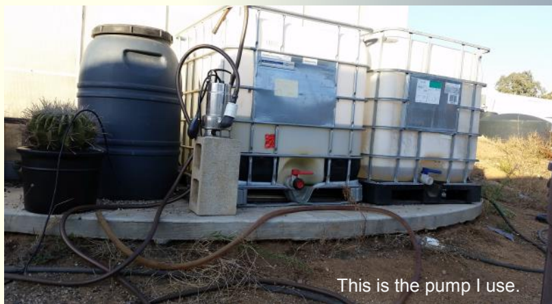
This is the pump I use.

They have both new and recycled barrels and totes: http://www.harborfreight.com/34-hp-stainless-steel-submersible-dirty-water-pump-with-tethered-float-2866-gph-69299.html