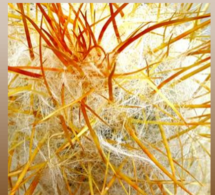
Oreocereus trolii spines Collette Parr