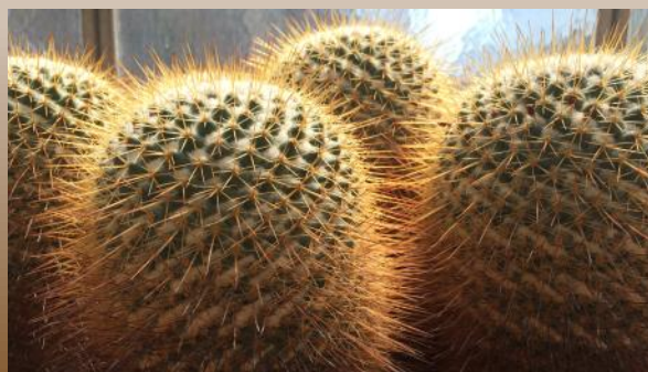
Mammillaria pettersonii