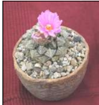
Garner's Ariocarpus fissuratus