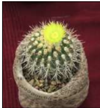
Miller's Islaya islayensis