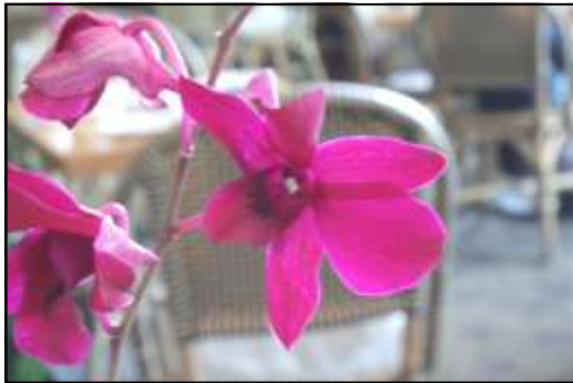
Orchid for sale, but brag-worthy!