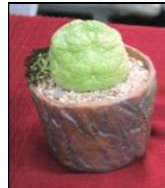
Garner's Pseudolithos eyelensis