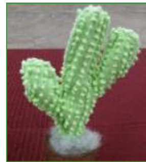
Best Use of Bedspread, Saguaro chenillensis , Juergen Menzel