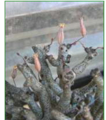
Tylecodon bucholziana and flower

are 2 to 3 feet long, rising above any nurse plants they may be growing under. The Tylecodon with the most striking flowers is the aptly named T. grandiflorus . It's relatively smaller plant, but has the largest flowers of the genus which are orange to red. In my opinion, the Tylecodon which is a must have for any succulent collection is T. bucholzianus . The stems themselves are the attraction here with a delicate texture and silvery coloring — tightly branched little sculptural arrangements, begging for a cool pot. The leaves are inconsequential little green sausages. Flowers are held close to the structure here and again are very delicate in appearance. All the Tylecodons I have experience with propagate easily from cuttings. The stems are somewhat fragile or brittle and break off easily, so it's nice that they root quickly. It's good to have some plants to play with while the majority of the collection is dormant, so watch for Tylecodons at the plant sales. You won't be disappointed.