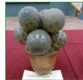
Best Use of Air, Tephrocactus hydroballoonensis , Candy Garner