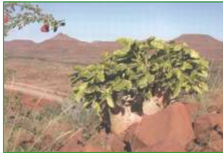
Possibly a Cyphostemma hybrid. Tim Harvey

Home to many of the plants we love to grow, e.g. most of the pachycaul Cyphostemma sp., the talk will highlight plants from the summer rainfall region, from the northern border with Angola, south to the Khomas Hochland plateau around the capital Windhoek. En route, the flora, including Euphorbia , Aloe and numerous bulbs and Stapeliads , to name but a few, will be illustrated in the majestic scenery that is their habitat. Cultivation of these plants in Southern California will also be discussed.