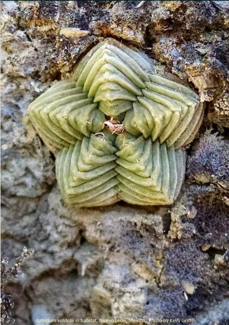
Aztecium valdezii in habitat, Nuevo Leon, Mexico.

Newsletter of the San Diego Cactus & Succulent Society An affiliate of the Cactus & Succulent Society of America