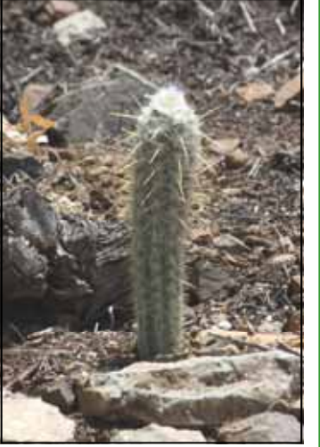
Oreocereus leucotrichus in backyard

This is a shrubby plant with many upward curving stems to 6 ft high. The 3 inch long central spines curve slightly and are yellow to maroon to orange protruding through