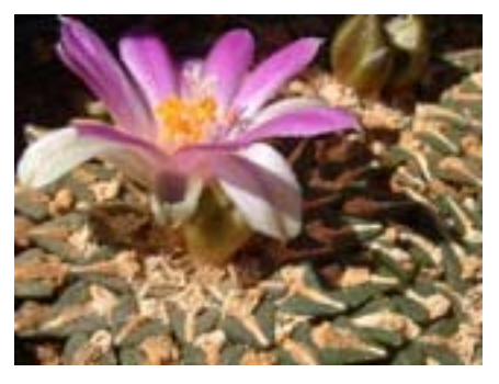
Ariocarpus trigonus horacekii in flower