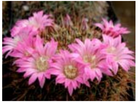
Mammillaria melanocentra ssp. Rubrograndis

propagator's standpoint it's like an opportunity to maybe squeeze a nice long flowering out of some species that were (if memory serves properly) rather quick last year. I'm thinking some of the pectinate Mammillarias like M. solisiodes, pectinifera, sanchez-mejorada, and humboltii (for instance) were rather quick last year. This year they seem content and determined to "give it the go" for a good long spell. some of these plants are nearly impossible to ever make "too much" seed of.