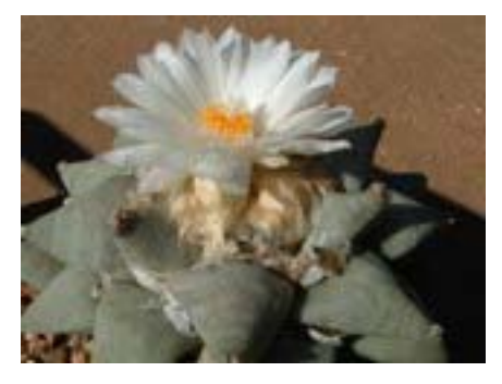
Ariocarpus trigonus horacekii