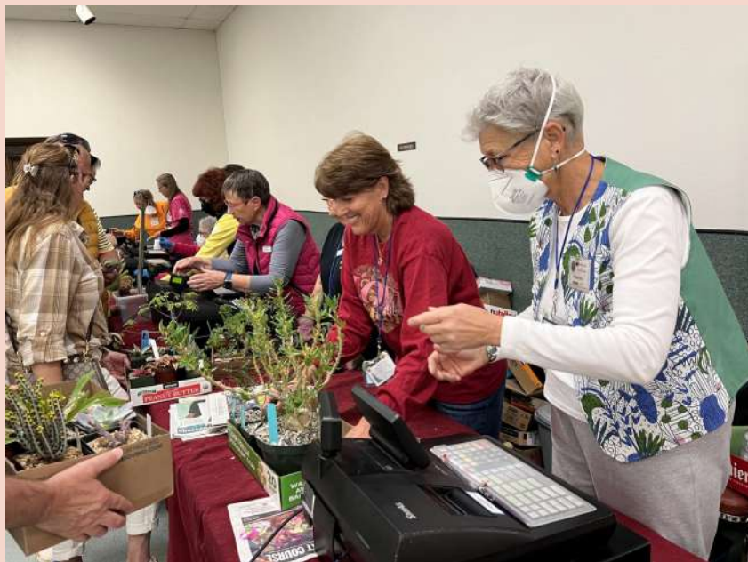
Our amazing cashier crew at work