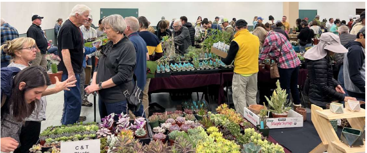
Bustling crowds at the vendor tables