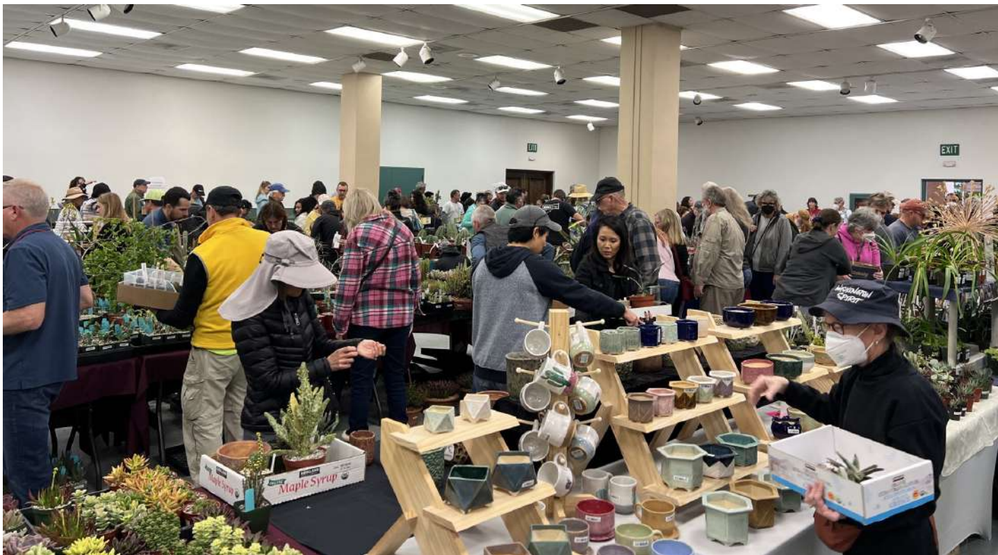
The crowds were hungry for pots and plants