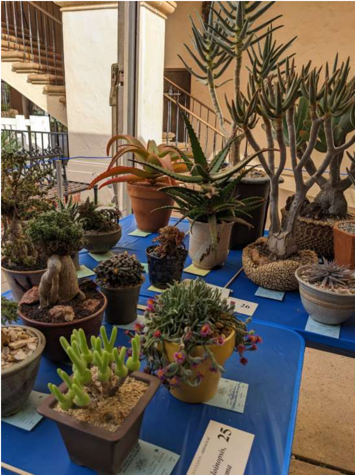
Some views of the Show tables

Did you have a good time at the show? So did we! Enjoy this gallery of moments from our Show displays, Sale vendors, volunteers and winners!