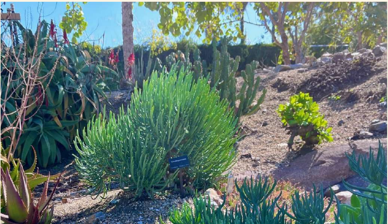
Tylecodon paniculatus at the African Rocks exhibit at the San Diego Zoo