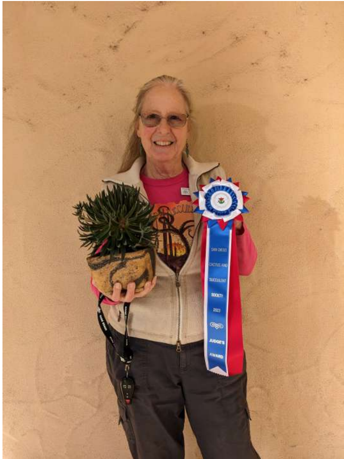
Winner smiles :]