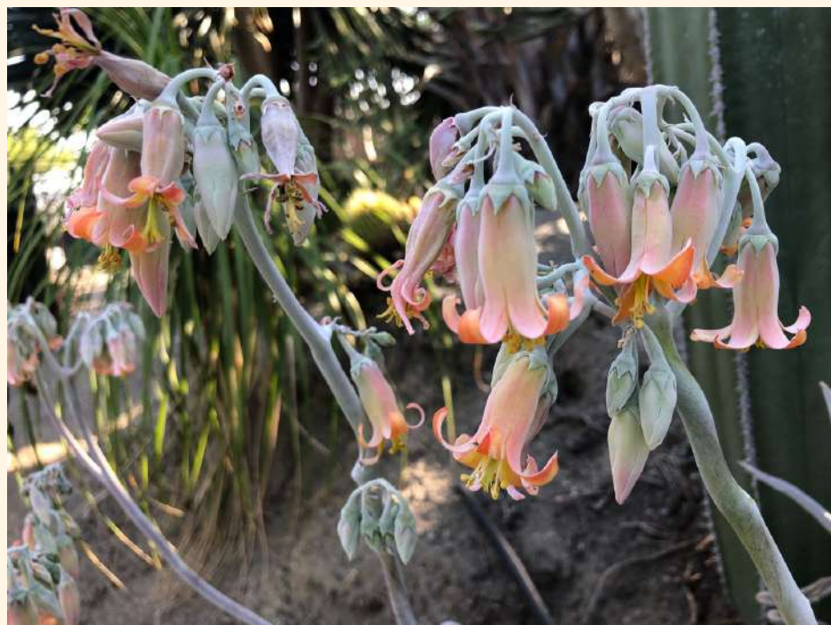
Cotyledon orbiculata plant in bloom, and flower detail