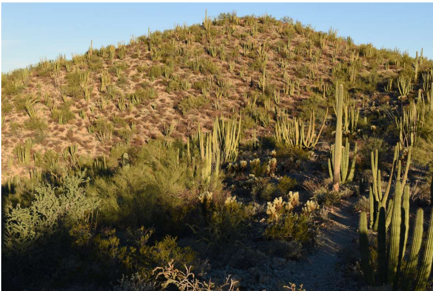
Greeted by a hill full of Saguaro and Organ Pipes ever-so-slightly waving at us in the wind