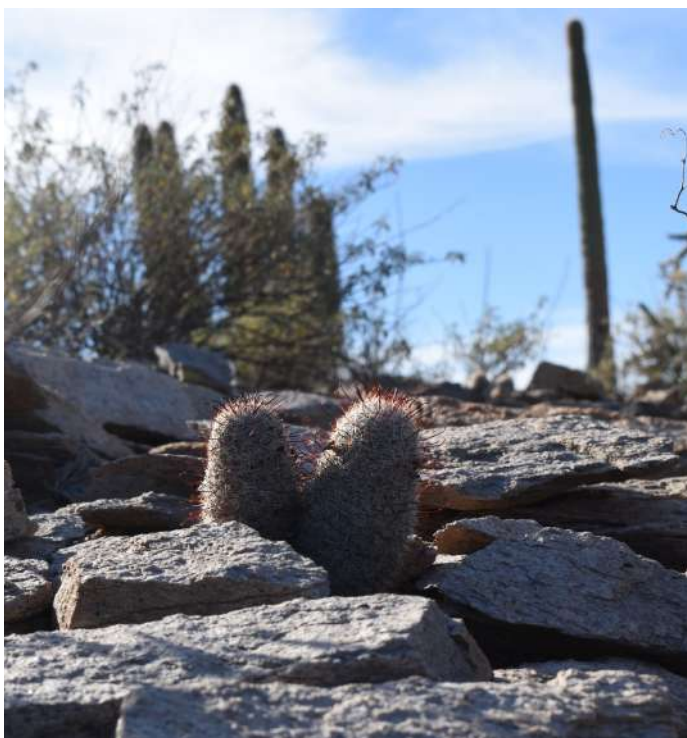
Mammillaria tetrancistra surrounded by giants