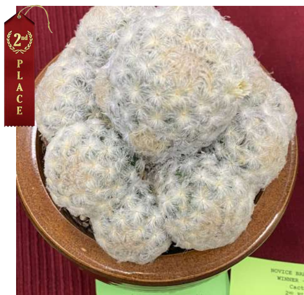
2nd : Mammillaria plumosa