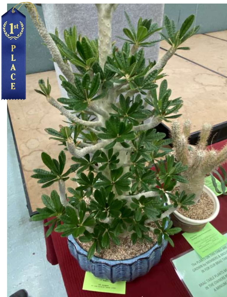
1st: Dorstenia gigas