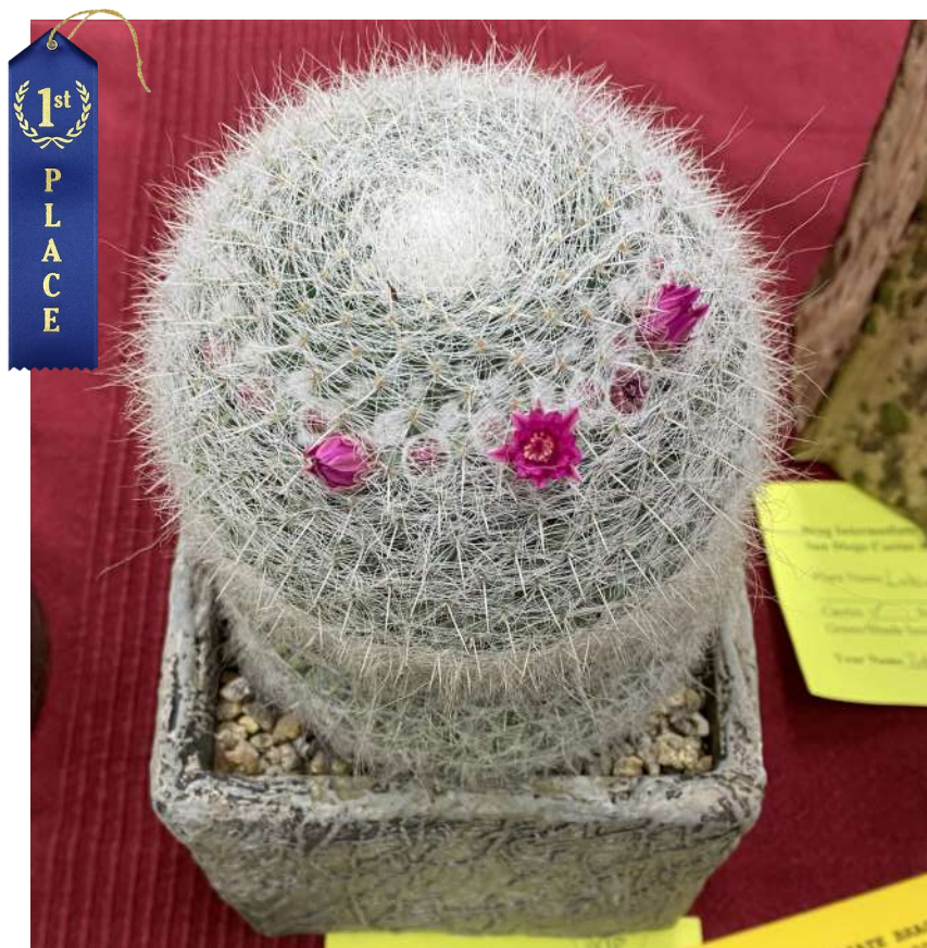
1st: Mammillaria hahniana