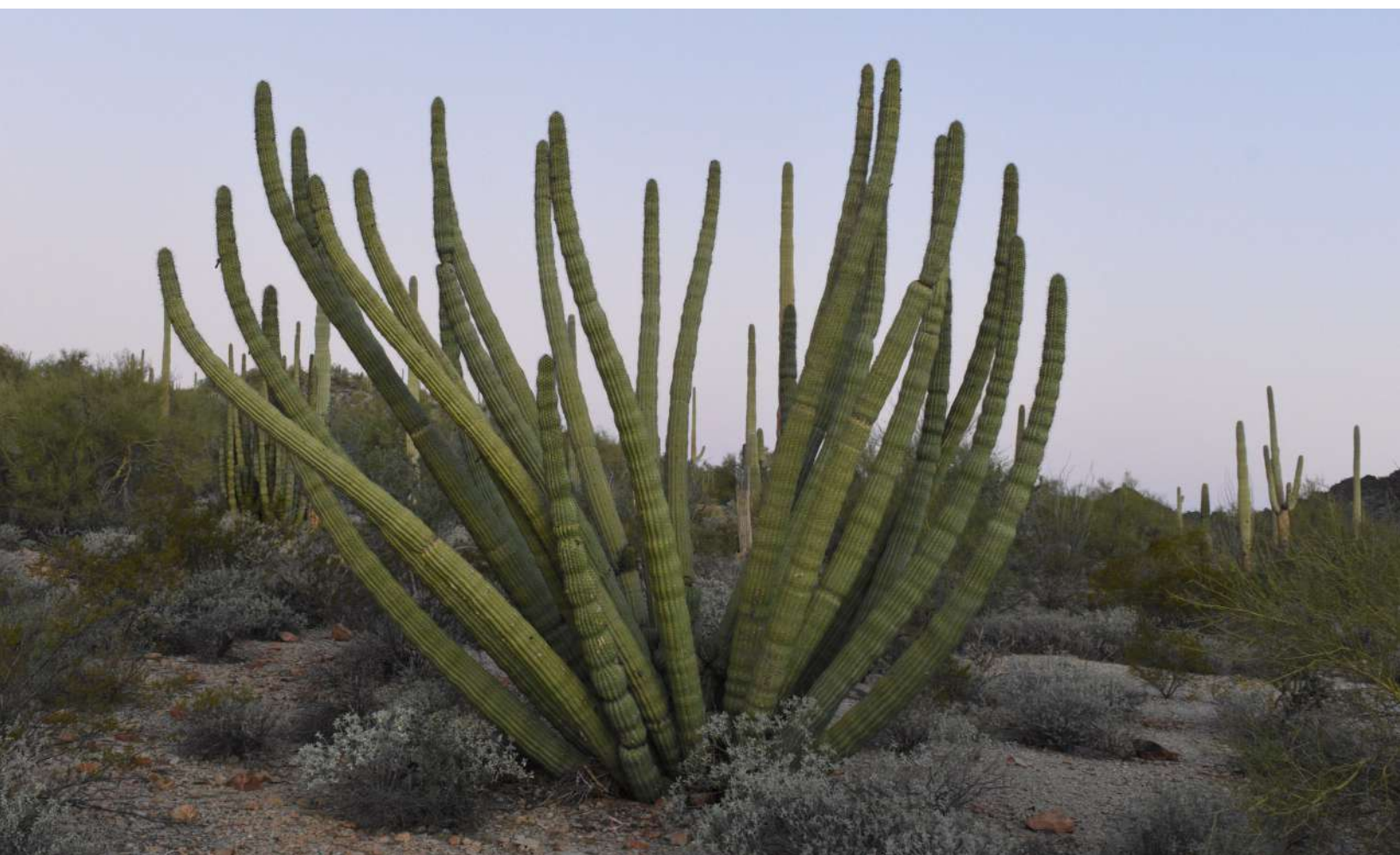
Stenocereus thurberi , the magnificent Organ Pipe cactus