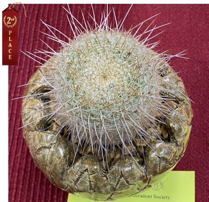
2nd: Mammillaria muehlenpfordtii