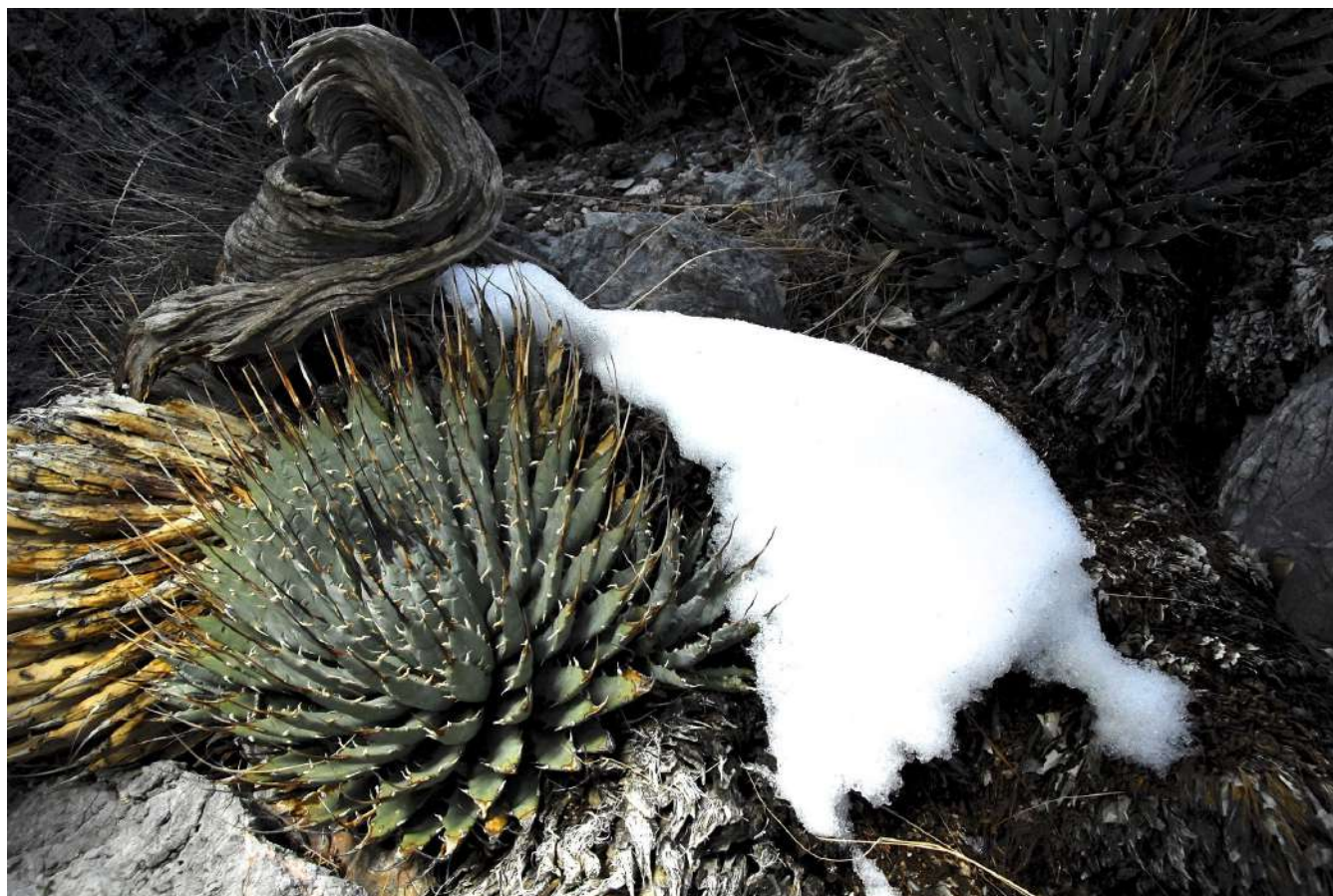
Agave under a blanket of snow