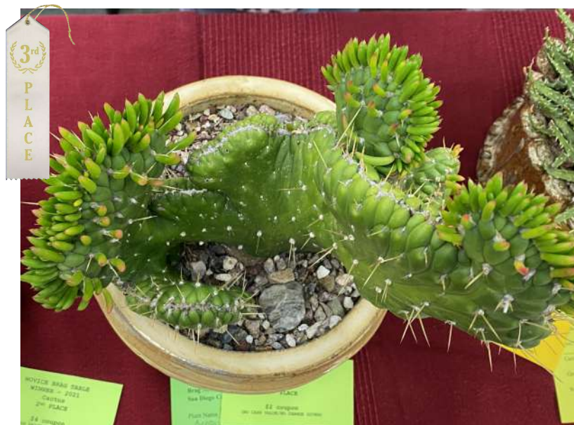
3rd : Austrocylindropuntia subulate crest