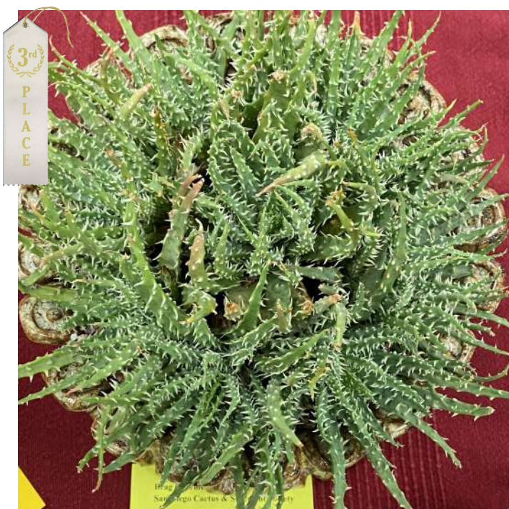
2nd: Aloe humilis