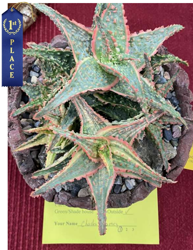
1st: Aloe sp.