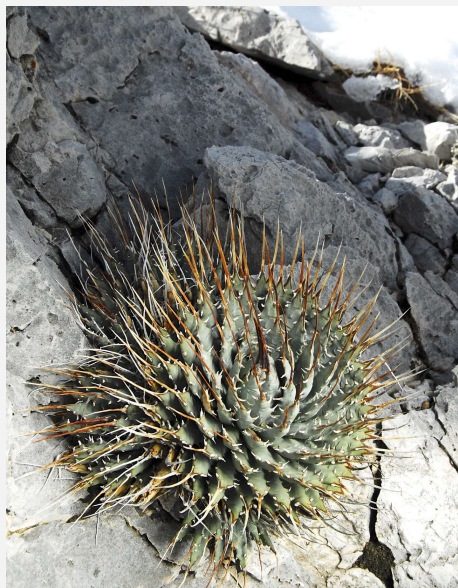
ON THE COVER Agave in the snow