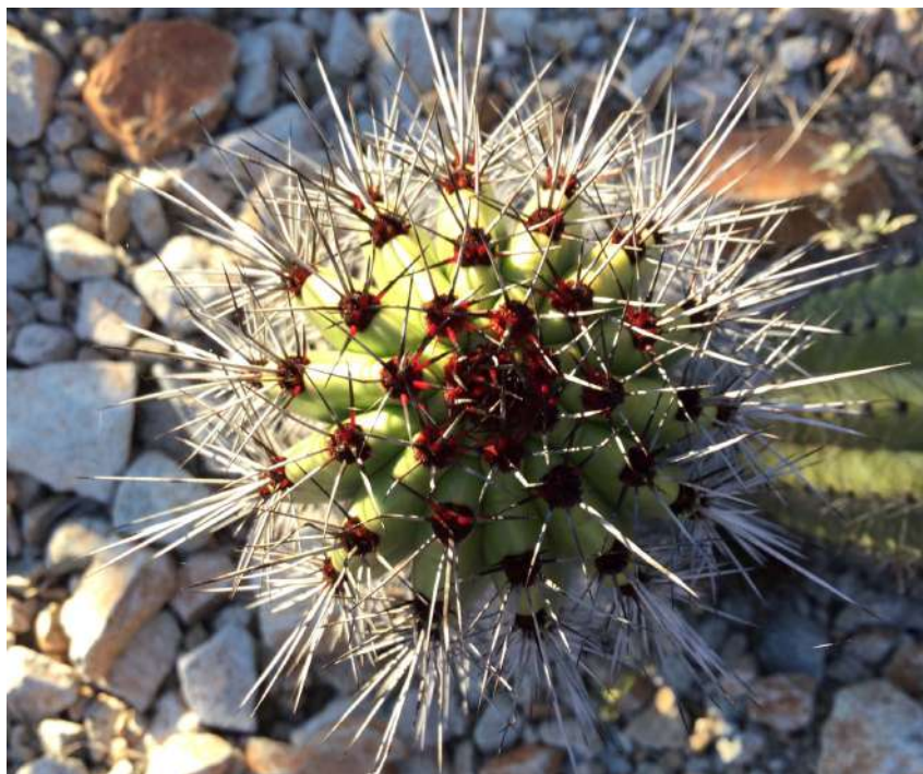
New red growth on top