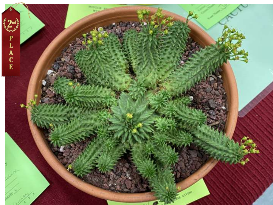
2nd: Euphorbia suzannae