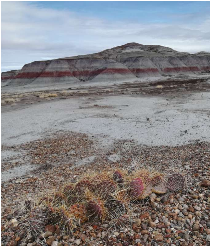
Opuntia at Petrified Forest NP