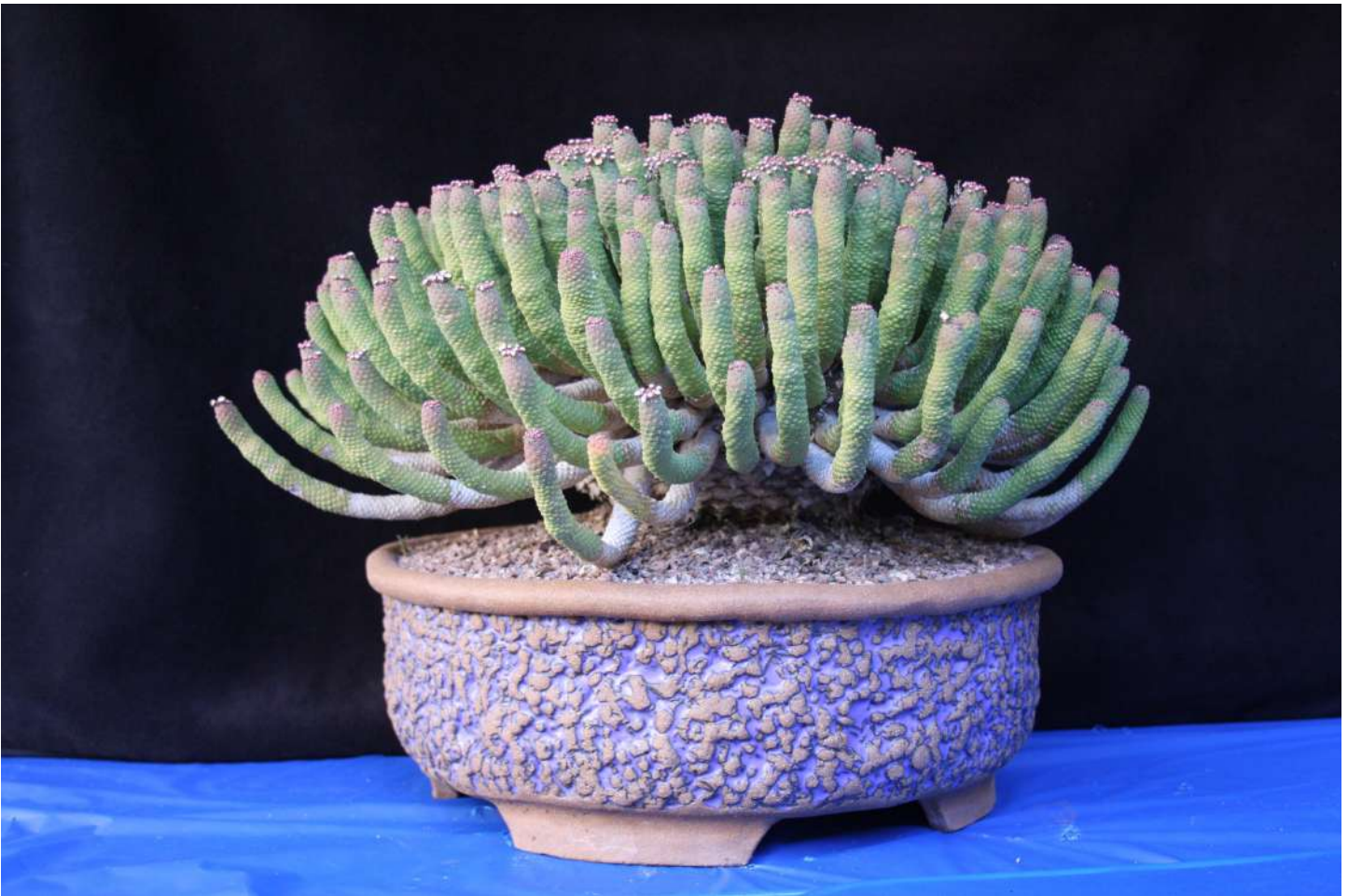
One of Peter Walkowiak's beautifully staged winning plants from the 2019 Winter Show