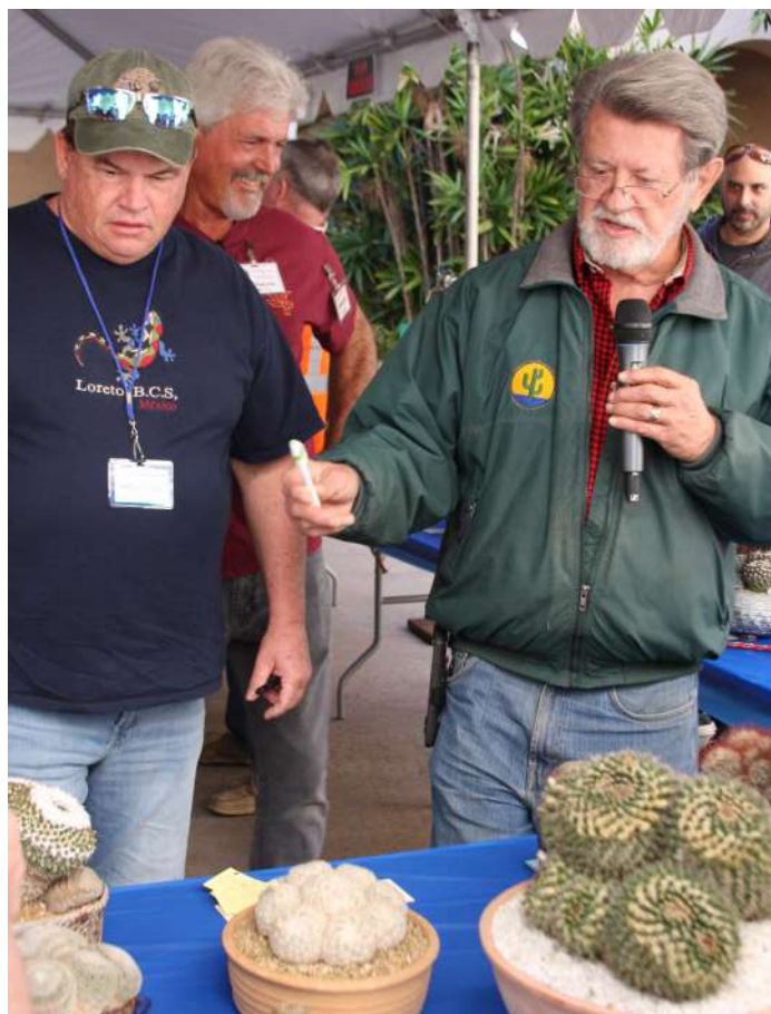
Judges at the 2019 Winter Show