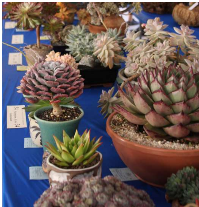
Nicely staged succulents

Top dressing is commonly gravel, crushed rock, pea gravel, coarse sand, etc. While the choice of top dressing is up to your preference, keep in mind that it should enhance, not distract from the plant. Bright colors are often distracting. You can look for top dressing at garden centers, aquarium stores, pet stores, and building supply centers.