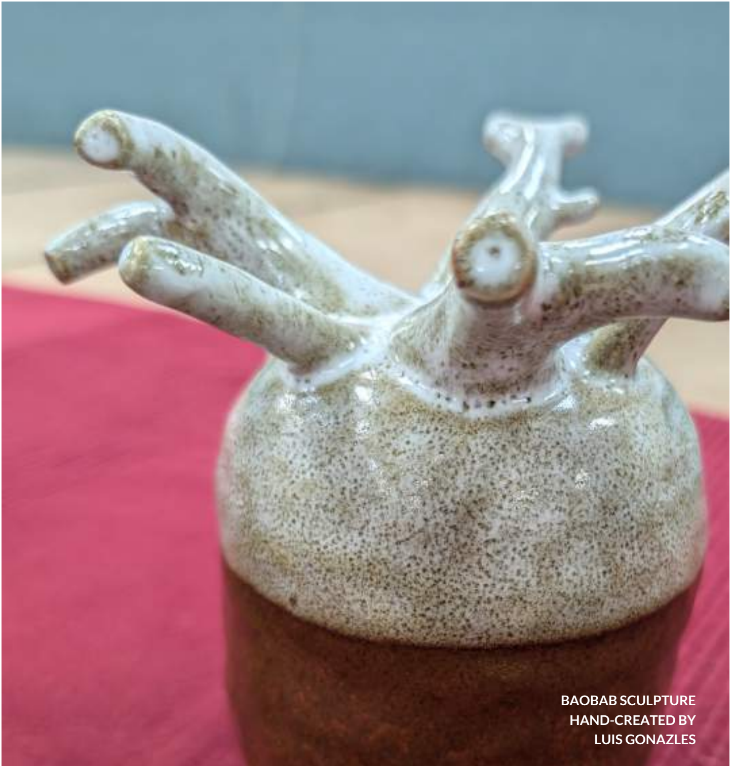
BAOBAB SCULPTURE HAND-CREATED BY LUIS GONAZLES

Thanks for contributing to the Faux Plant Table!