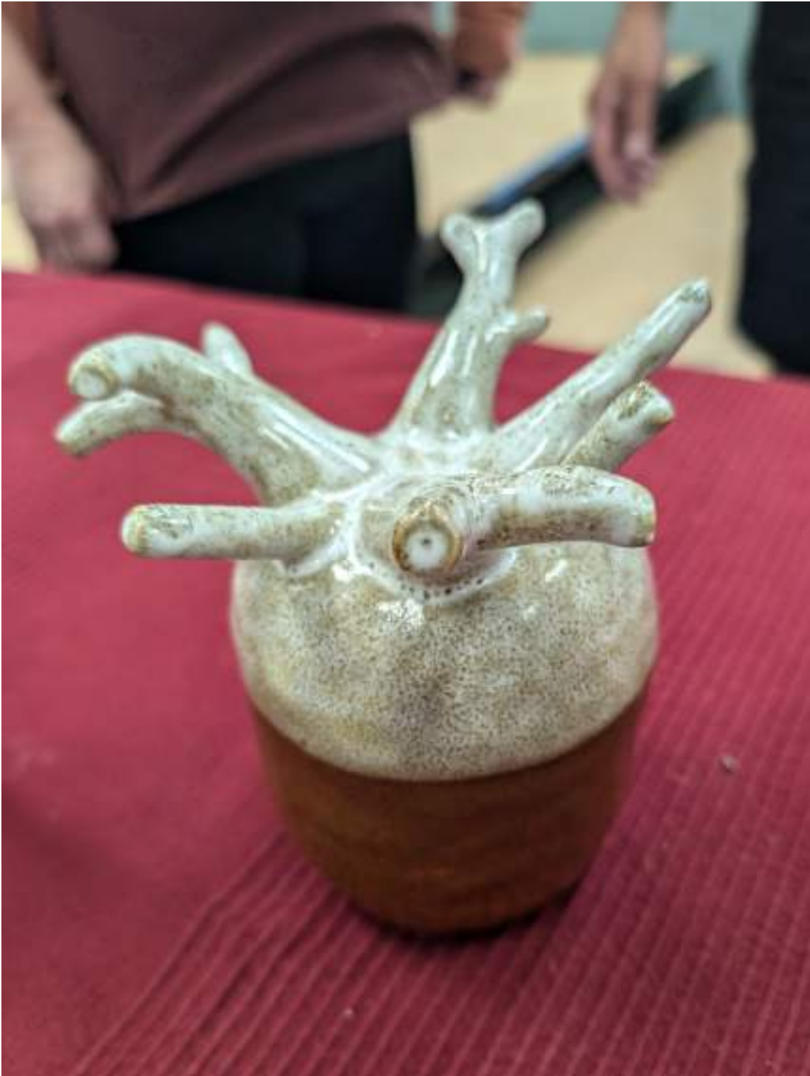
ADANSONIA GRANDIDIERI SCULPTURE