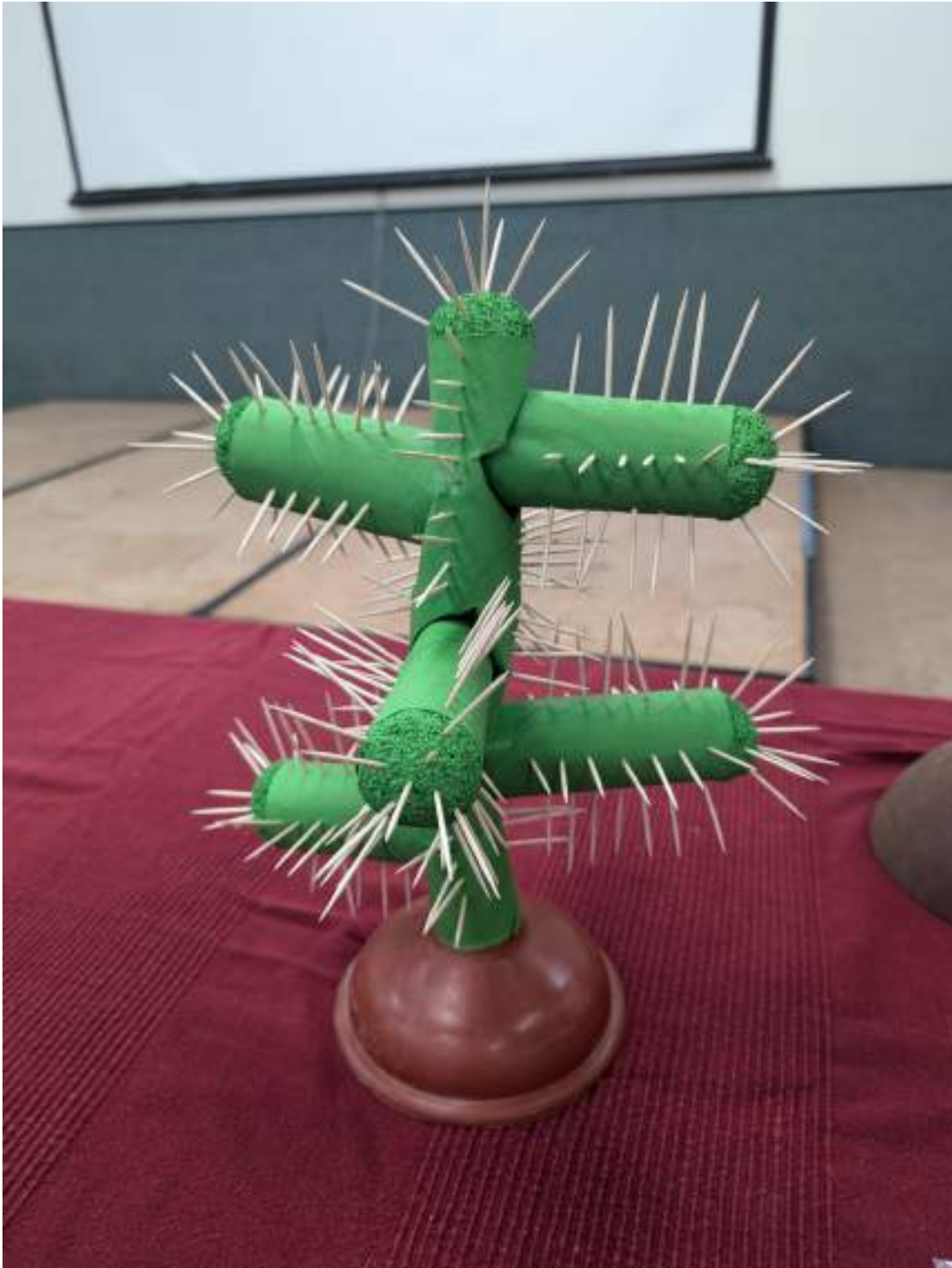
POOPER CRACKCLEENII "TOILET ROLL CHOLLA"