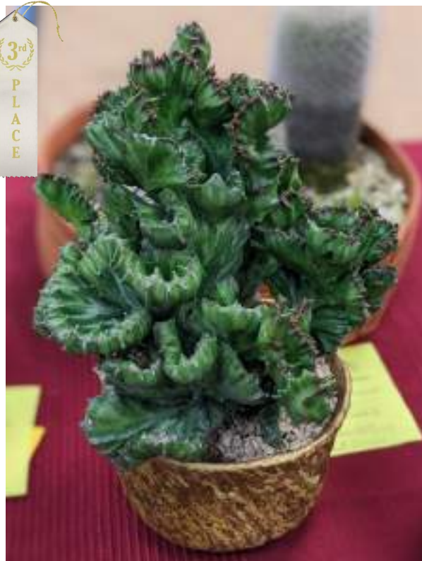
3RD: EUPHORBIA LACTEA CRESTED HEATHER CHAN