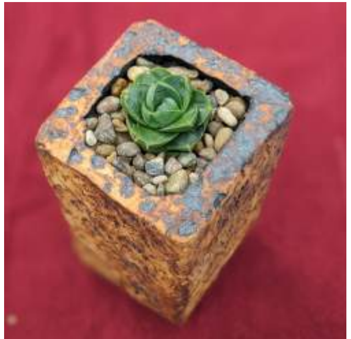
AGAVE 'SNAIL SNACK' X BGLow