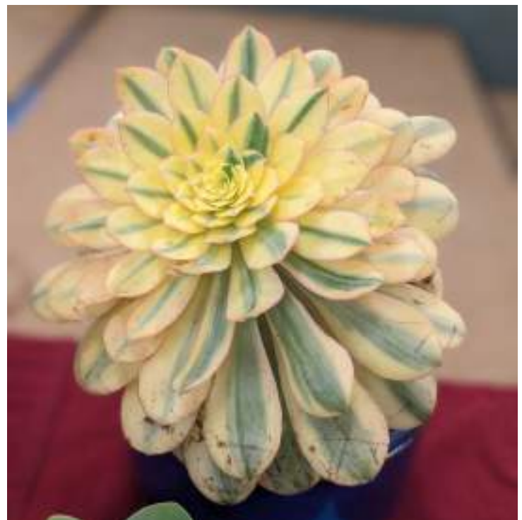
AEONIUM 'SUMBURST' [NAME UNAVAILABLE]