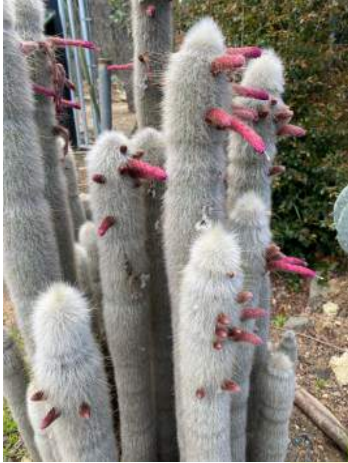
Cleistocactus strausii "Silver Torch" Mar 2024