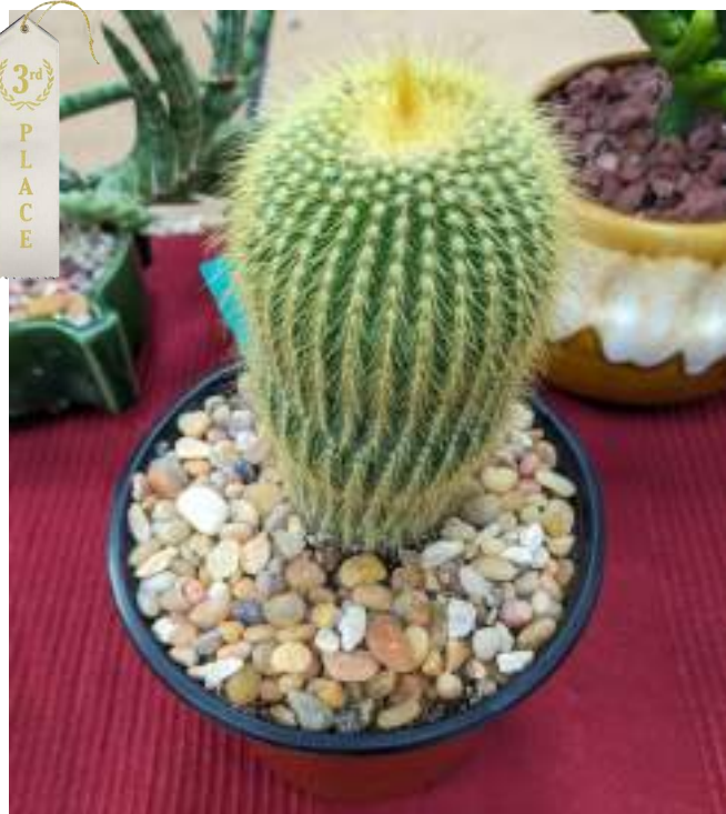
3RD: PARODIA LENINGHAUSII