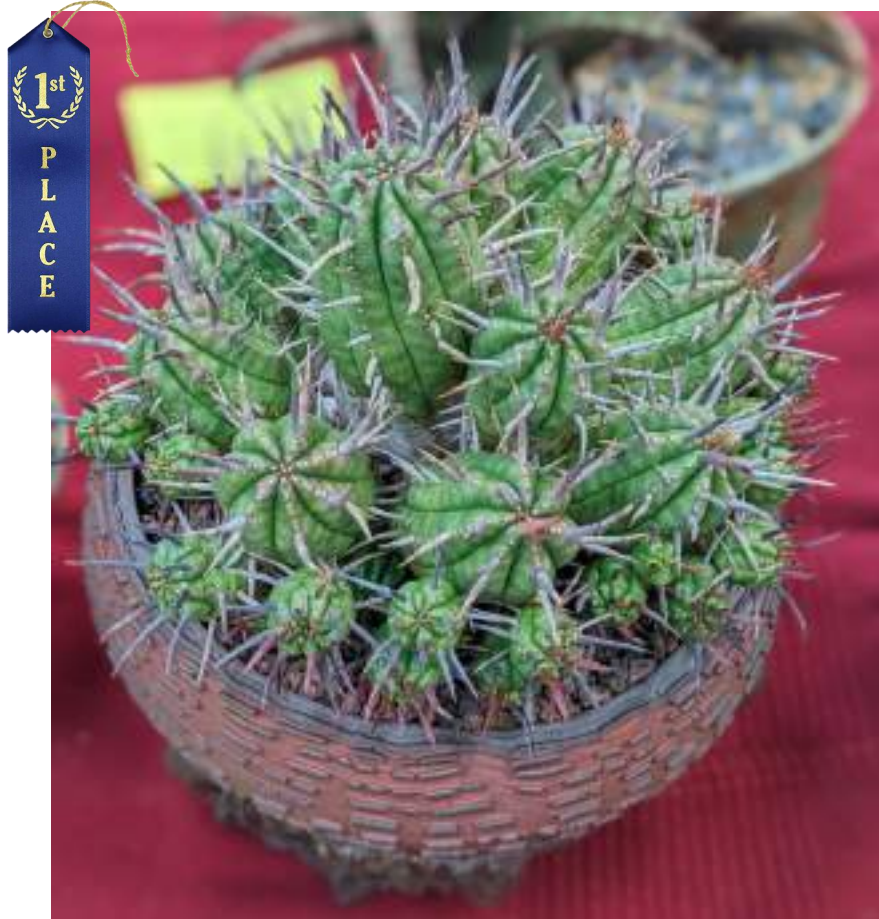
1ST: EUPHORBIA FEROX