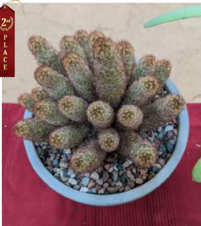
2ND: MAMMILLARIA ELONGATA