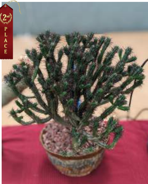
2ND: EUPHORBIA ENLOPA HEATHER CHAN