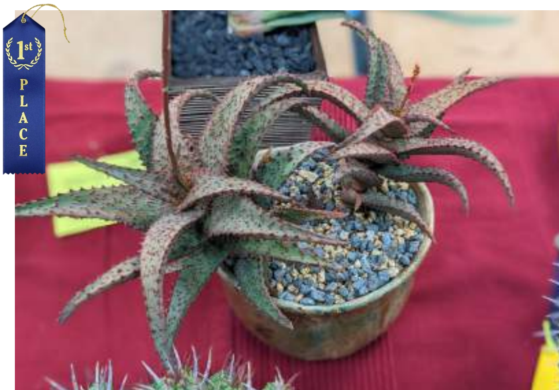
1ST: ALOE 'WILDFIRE'