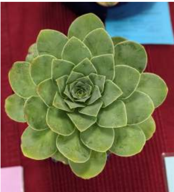
GREENOVIA 'PANDORA' [NAME UNAVAILABLE]