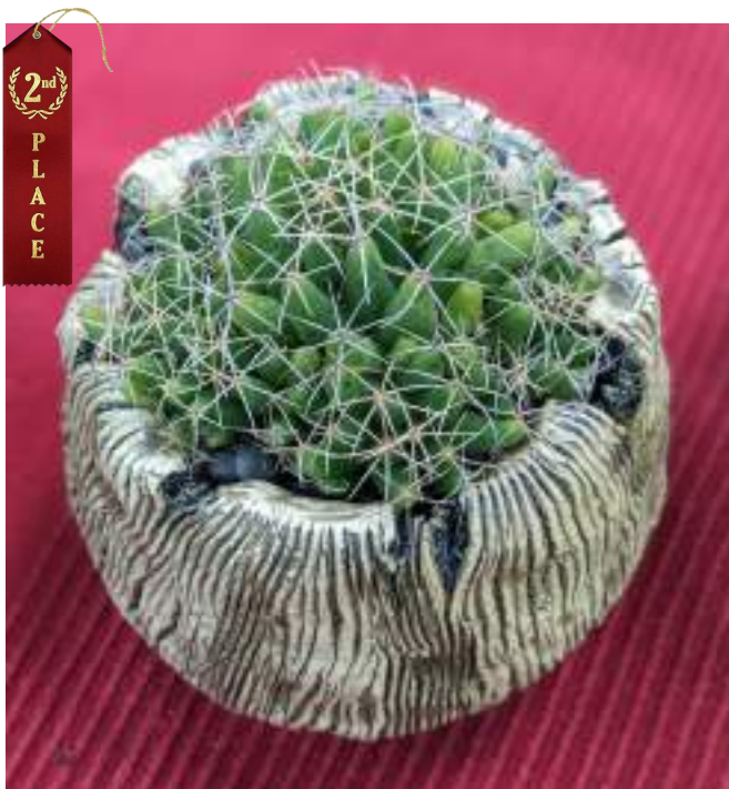
2ND: MAMMILLARIA LONGIMAMMA