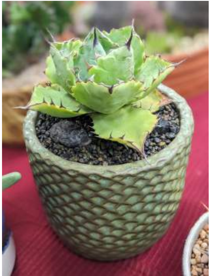
AGAVE ISTHMENSIS X TITANOTA