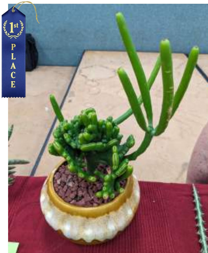
1ST: EUPHORBIA ALLUAUDII