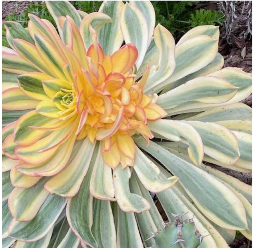
Aeonium 'Starburst' goes wild

Any members who can help out by bringing a small contribution of snacks (such as fruit, crackers, cookies, sweets, or other similar items), the club would be most appreciative. Thank you for helping us make our gatherings – and even our snack breaks – extra special!