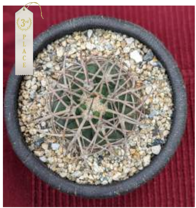
3RD: GYMNOCALYCIUM SPEGAZZINII