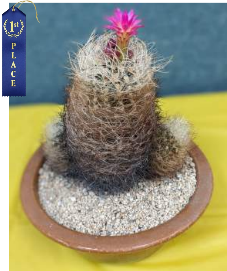
1ST: NEOPORTERIA NIDUS SENILIS