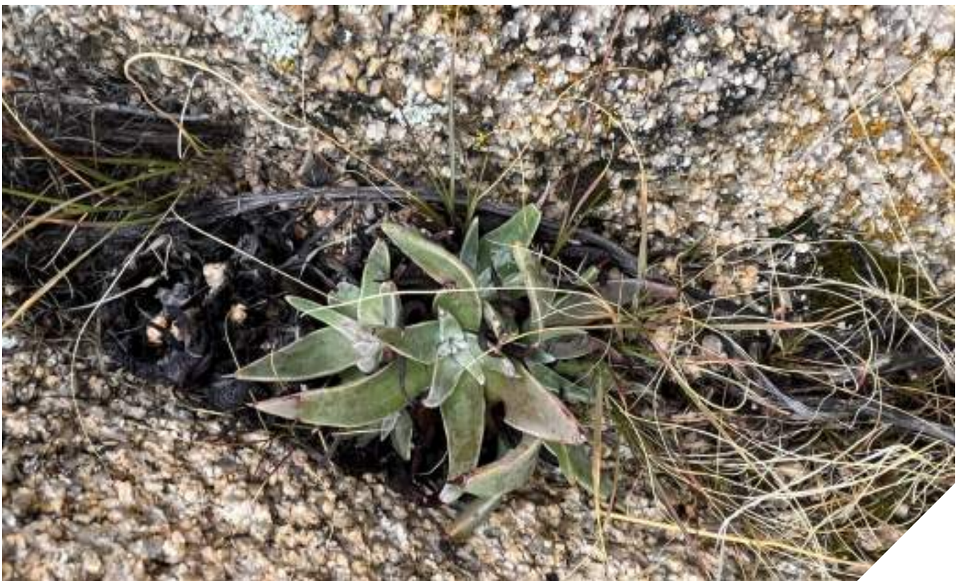
Dudleya saxosa ssp. aloides in a crevice at Joshua Tree National Park on a rainy day!