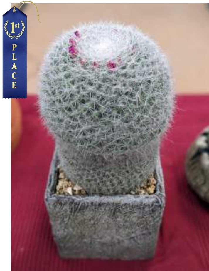
1ST: MAMMILLARIA HAHNIANA