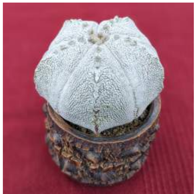
ASTROPHYTUM ONZUKA HYBRID