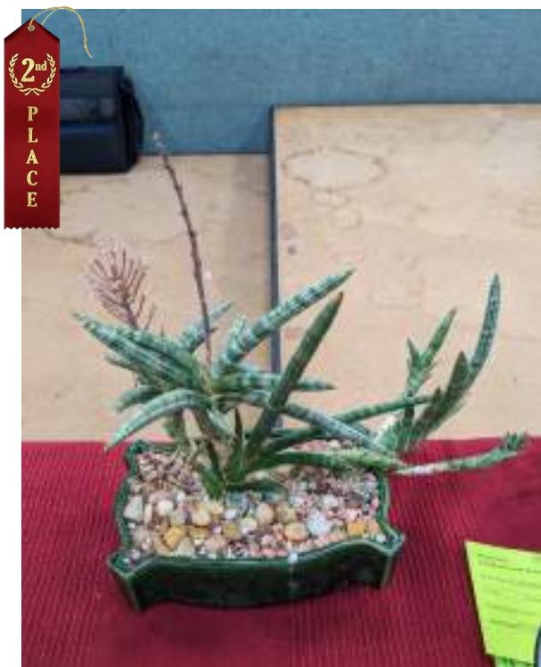
2ND: DRACAENA SP.