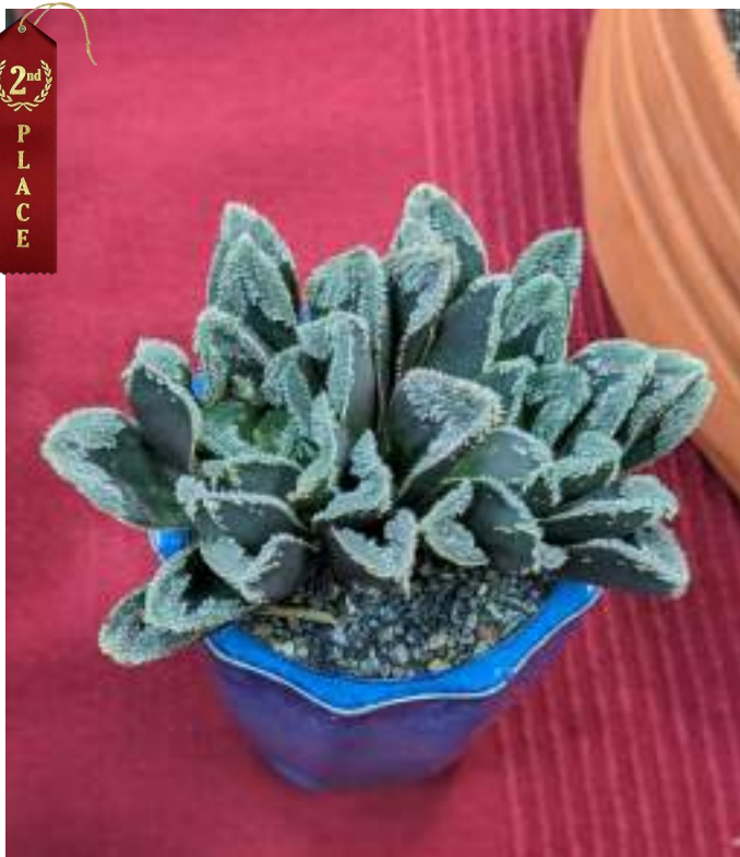
2ND: HAWORTHIA SP. CHUCK RAMEY