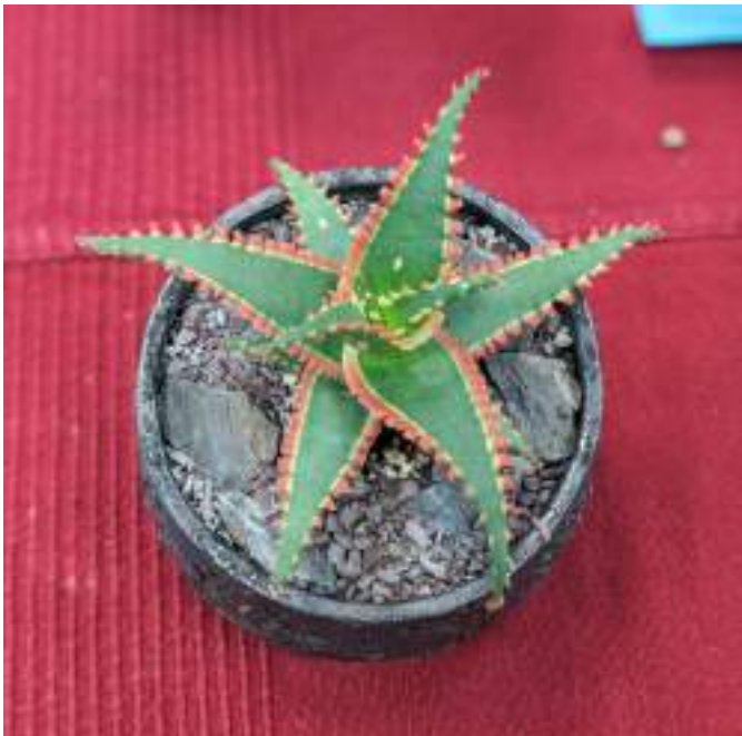
AGAVE CV. BRITTLESTAR X