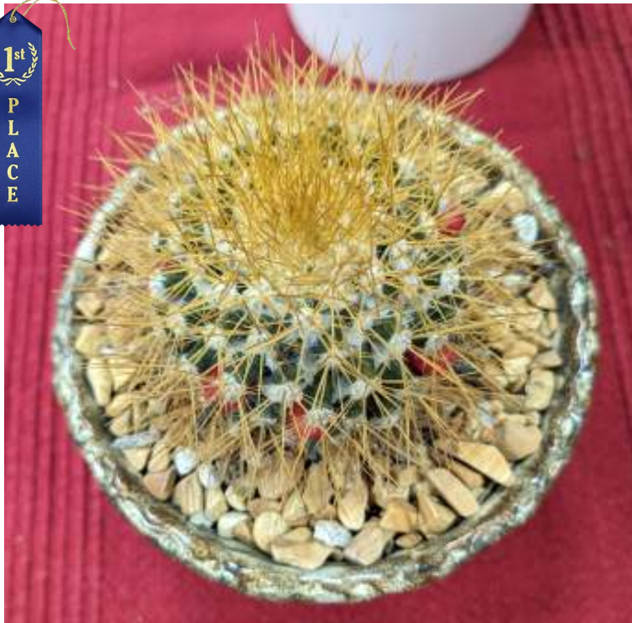
1ST: MAMMILLARIA SP.