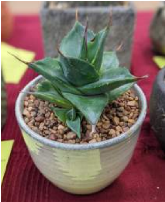
AGAVE SHAWII MONSTROSA