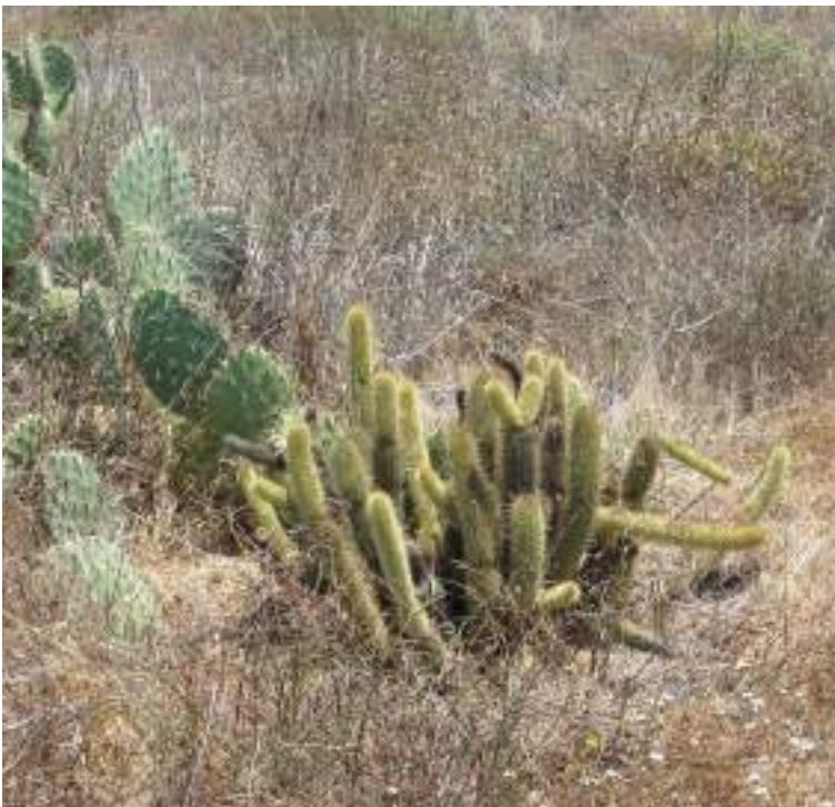
Torrey Pines Bergerocactus emoryi