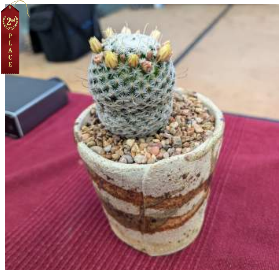
2ND: MAMMILLARIA DUWEI