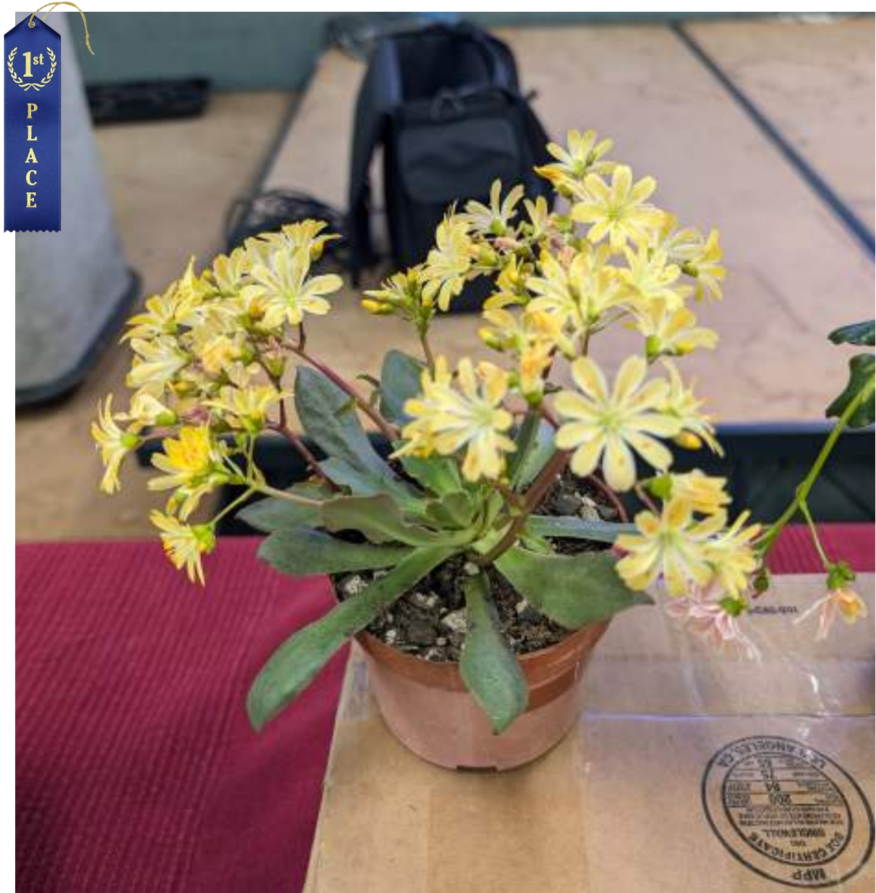
1ST: LEWISIA SP.