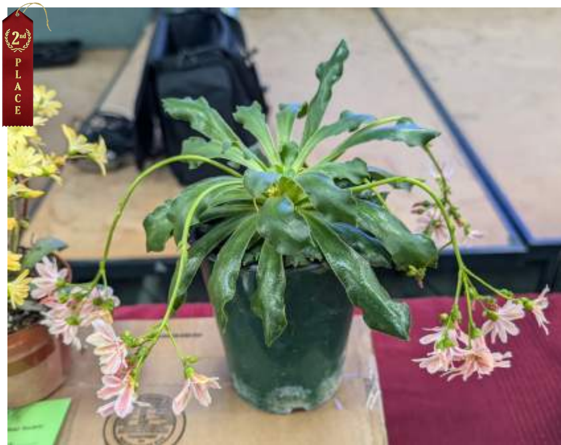
2ND: LEWISIA SP.