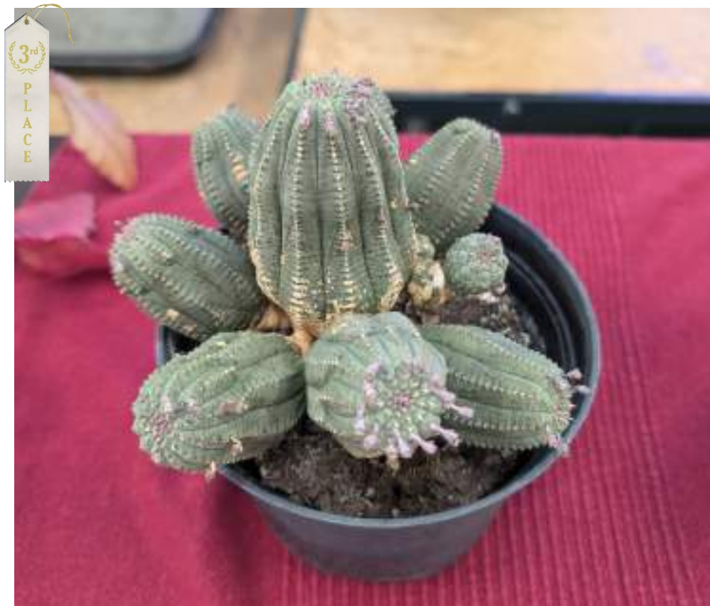
3RD: EUPHORBIA SP.