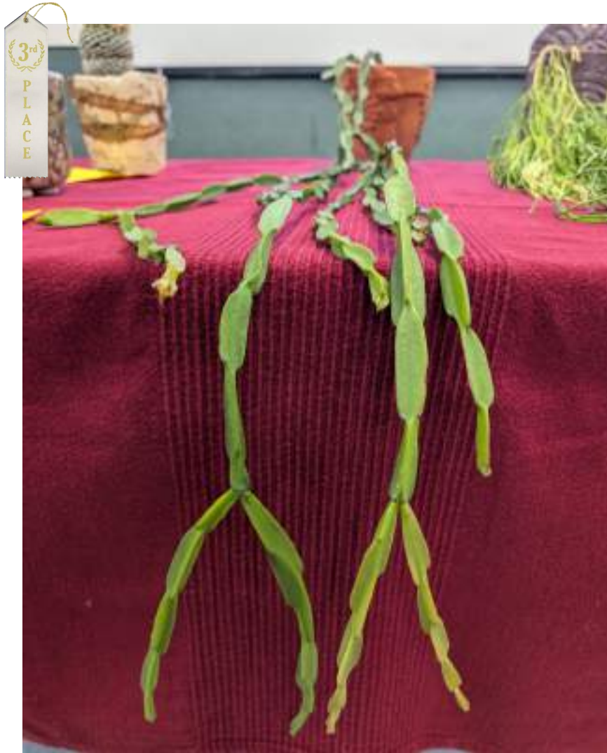
3RD: RHIPHALIS PARADOXA