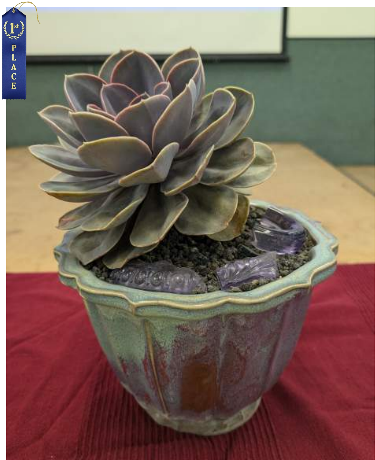
1ST: Echeveria 'PURPLE PEARL'