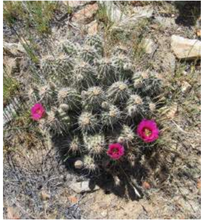
Echinocereus engelmannii ssp. engelmannii Olga Batalov