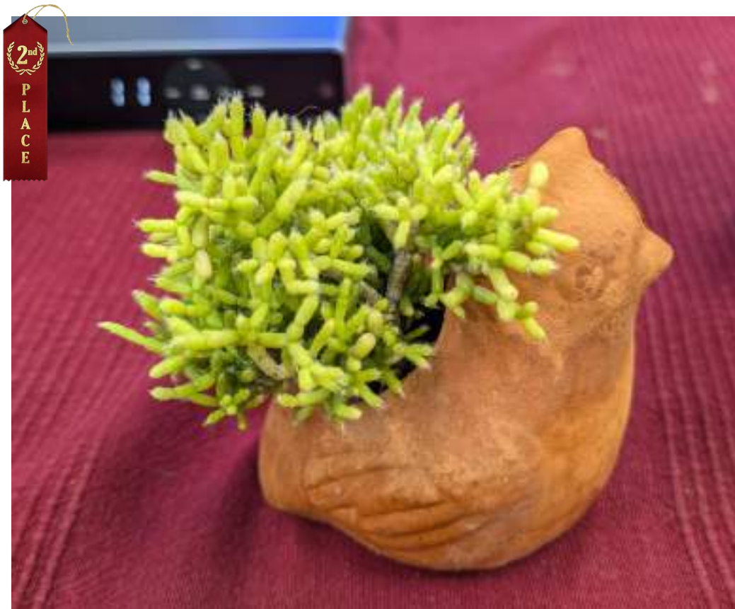
2ND: RHIPSALIS CEREUSCULA