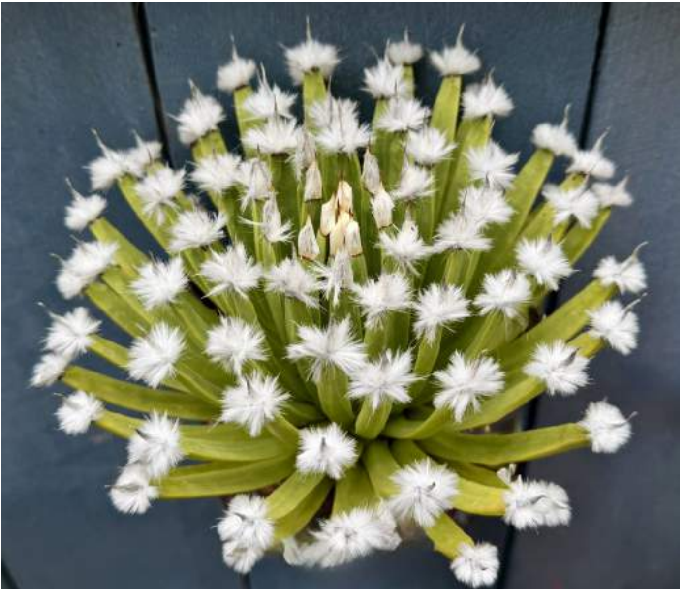
A bit of furry Agave albopilosa to match the fuzz featured on the cover of this issue