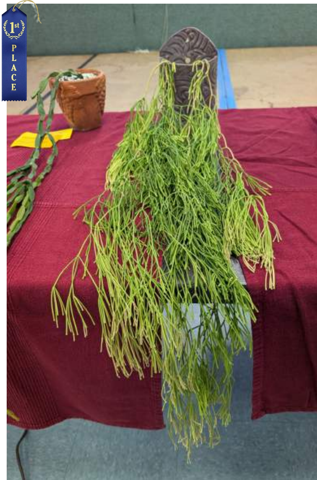
1ST: RHIPHALIS CASSUTHA