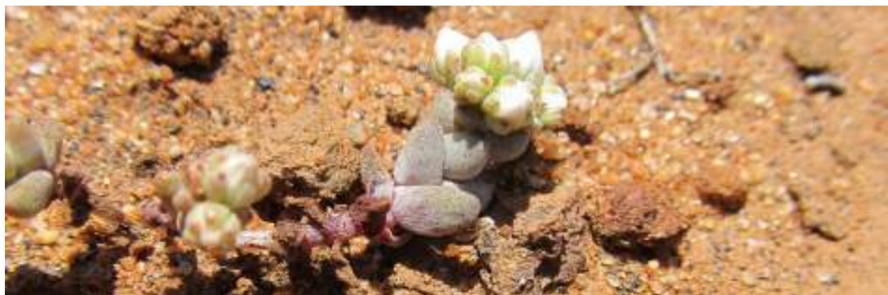
An impressive Dudleya brevifolia in flower, found at Carmel Mountain.

https://inaturalist-open-data.s3.amazonaws.com/photos/639951054/original.jpg