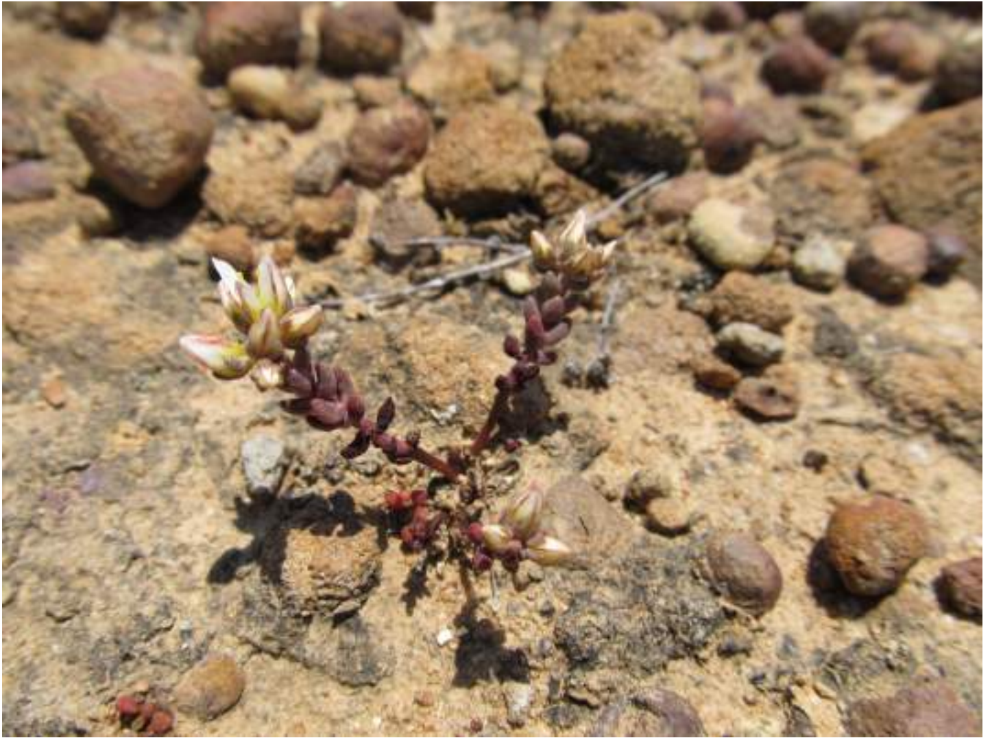
Short-leaved Liveforever Dudleya brevifolia , spotted on a hike with SDCSS friends